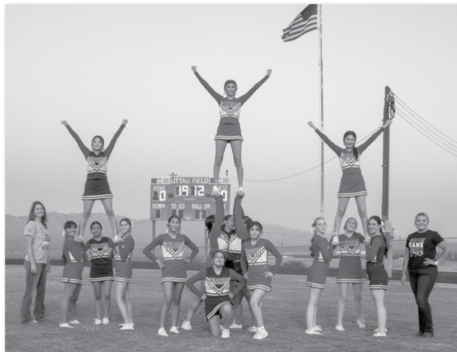
The San Manuel Cheerleaders wowed the crowd at halftime.