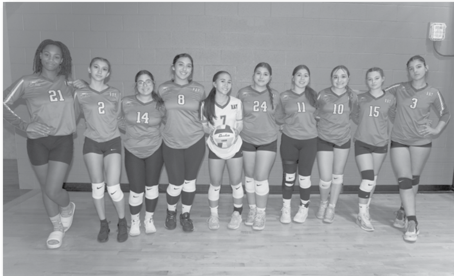
2024 Ray Lady Bearcats.

The Lady Miners will take on Ray and Superior this week.