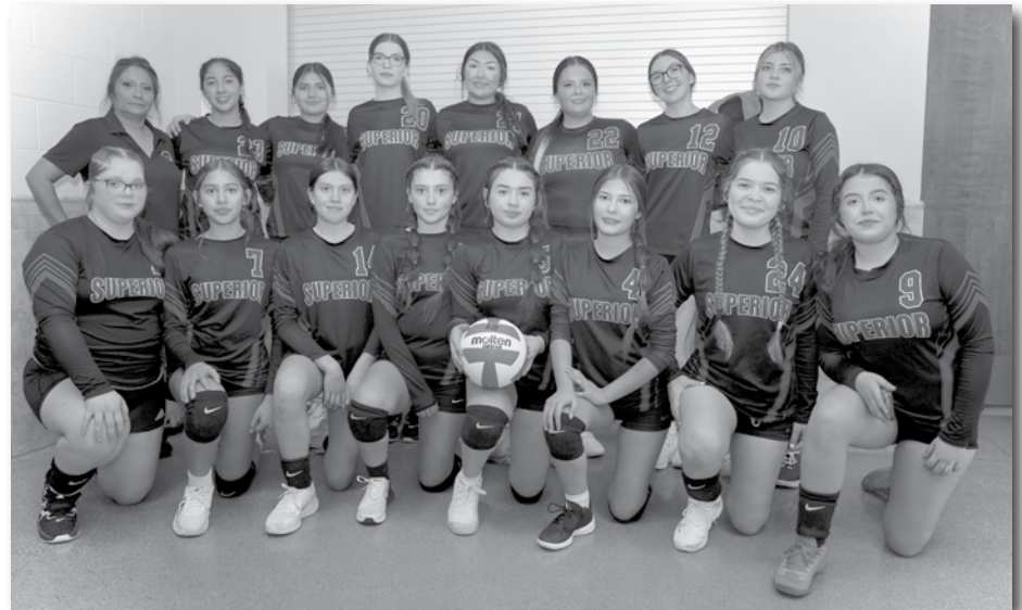
2024 Superior Lady Panthers.