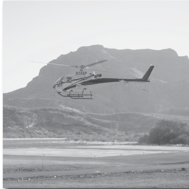
A Native Air helicopter landed at the new landing zones at the Superior Airport.

Besich handed the scissors to Councilmember Armitage to cut the ribbon.