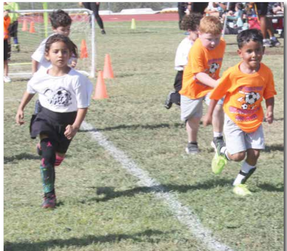
Soccer tournament was held in Kearny Saturday morning. Several teams from the Copper Corridor were participating.