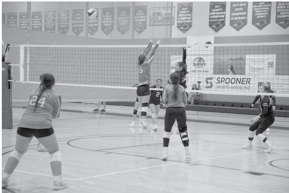
The Ray Lady Bearcats and the Superior Lady Panthers play in the Small Schools Invite Sept. 7.