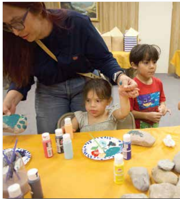
The Town of Superior Parks and Recreation department hosted a Back to School Festival at Town Hall, 199 Lobb Ave., on Thursday, August. 1, 2024. There were fun crafts, activities and snacks for students in grades Kindergarten through sixth grade.