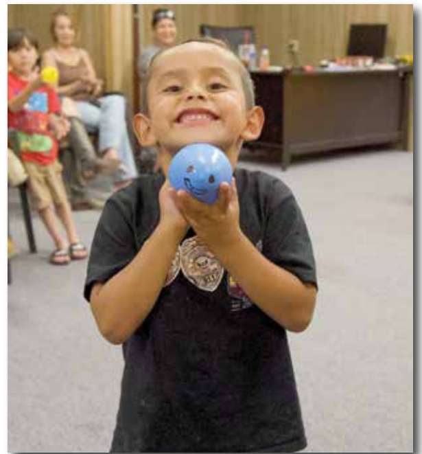
The Town of Superior Parks and Recreation department hosted a Back to School Festival at Town Hall, 199 Lobb Ave., on Thursday, August. 1, 2024. There were fun crafts, activities and snacks for students in grades Kindergarten through sixth grade.