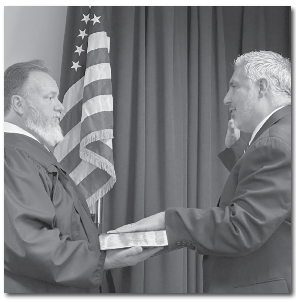
Carlos Galindo-Elvira is sworn in to the Phoenix City Council.