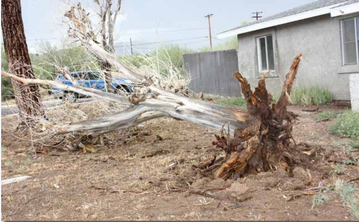
A storm came through Kearny Thursday afternoon with high winds, dumping heavy rain. Some trees were uprooted and lots of things were blown around.