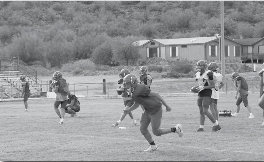
Hayden players on the field.