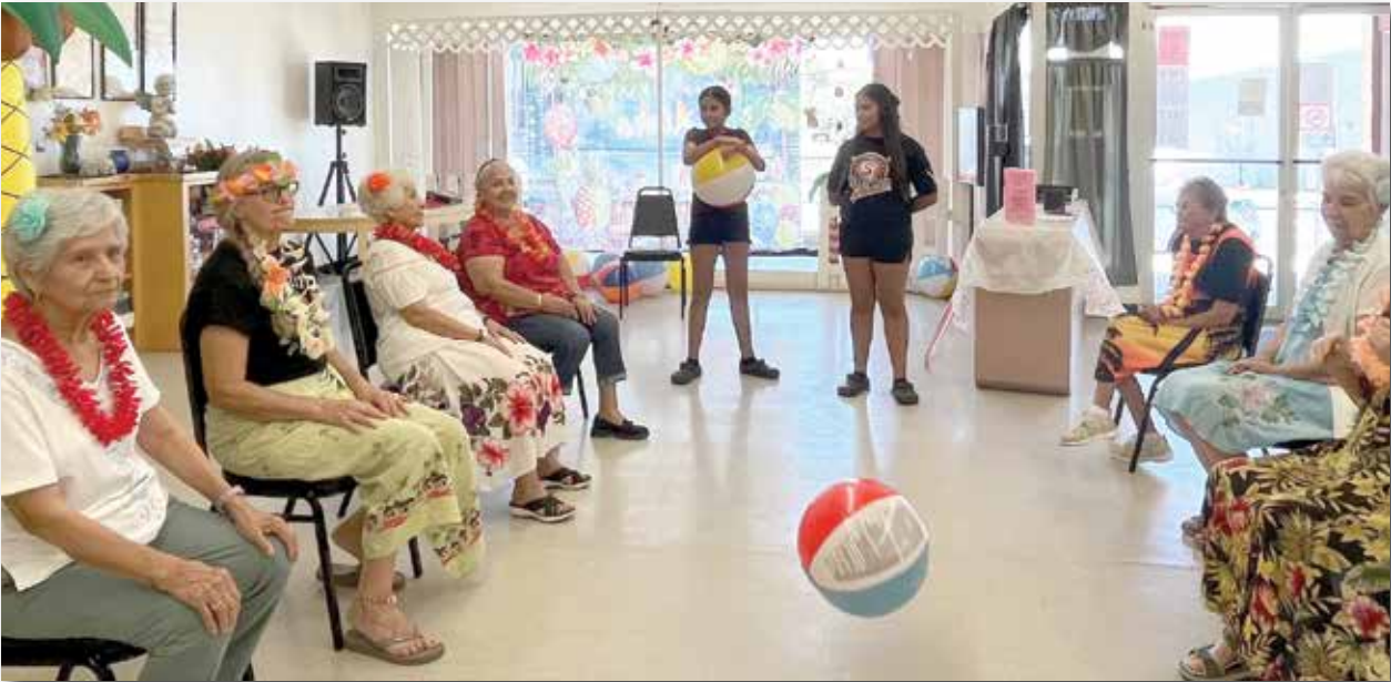
At the Superior Senior Center’s First Friday Social, those in attendance played beach games: volleyball, pong toss and had a human slot machine. The seniors had a lunch from Panda Express and some pineapple cake for dessert. Everyone had a great time.