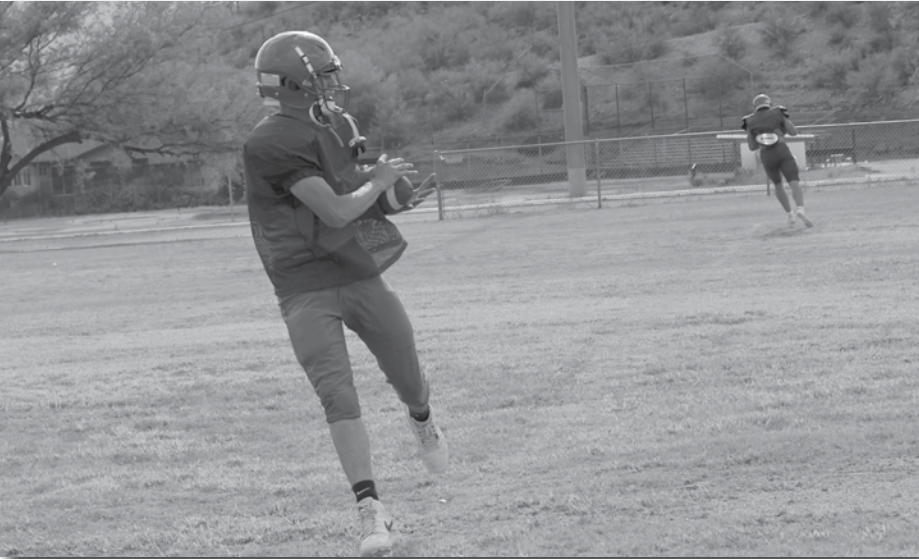
Hayden players on the field.