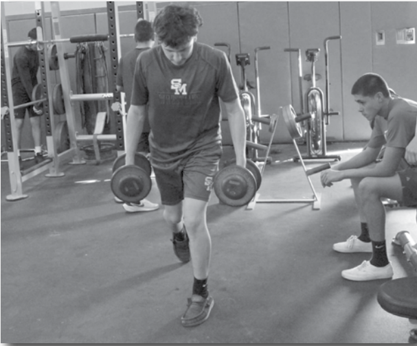
San Manuel players in the weight room.

The Bearcats will officially kick off their season with a