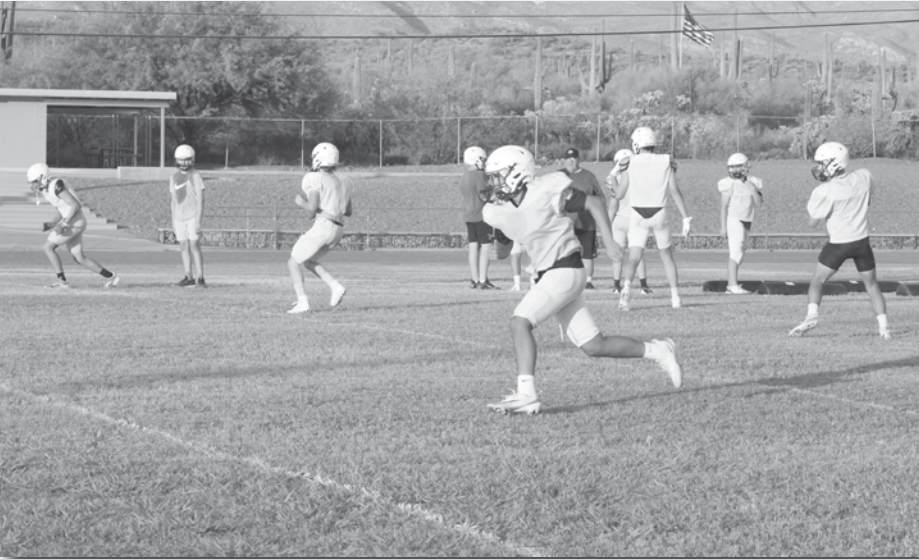
Ray players on the field.