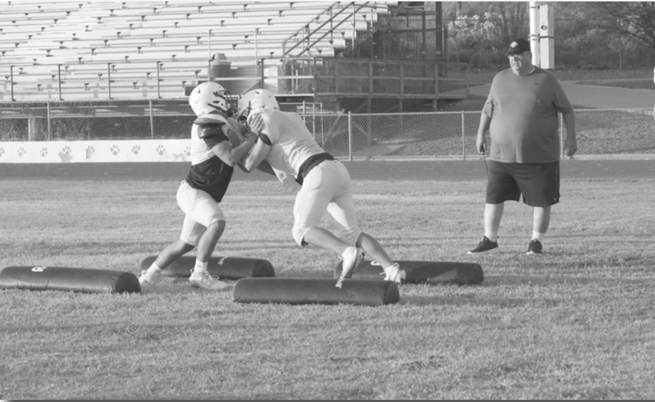
Ray players on the field.