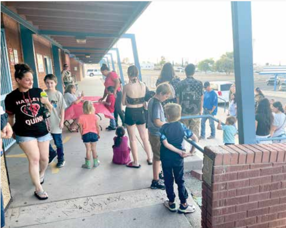
Mammoth and San Manuel families were invited to a back to school bash on Aug. 7.