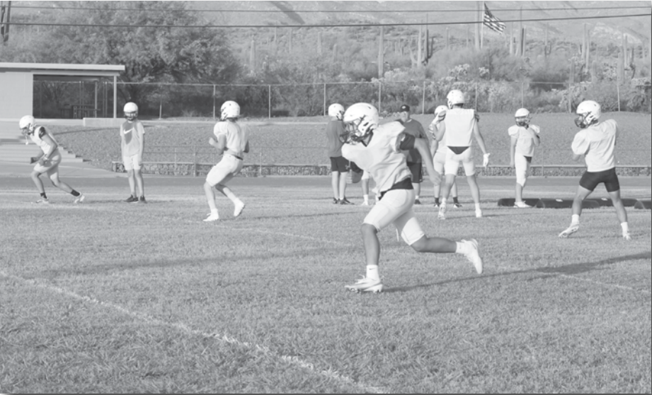
Ray players on the field.