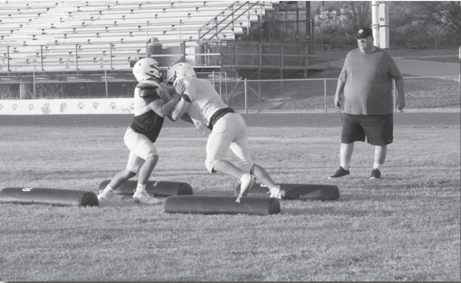
Ray players on the field.