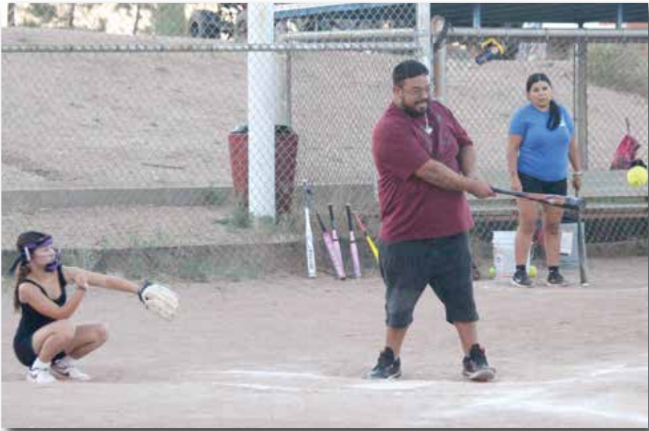
On Wednesday, Aug. 6, the San Manuel Summer Softball league held a parents vs. kids pick-up game. Kids of all ages took to the plate to play against the parents on the field. It was a game full of laughs. The closing ceremonies for the SM Summer Softball League will be determined at a later time.