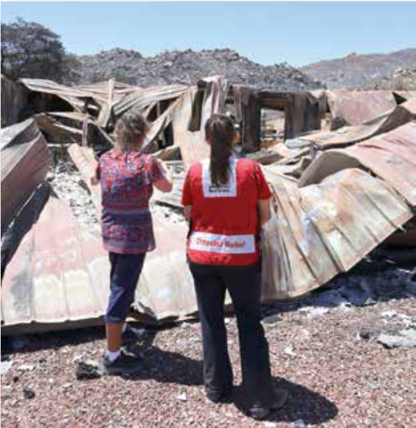
A Red Cross responder talks with a disaster victim.