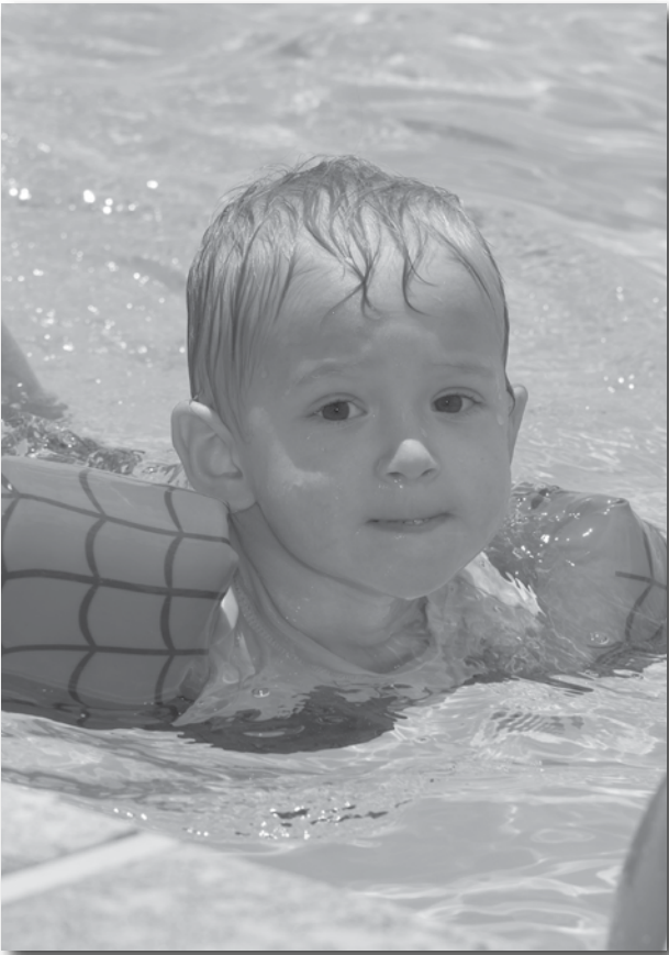
The Town of Superior, as part of their July 4th celebration, opened the pool for free swimming. Families had fun swimming, playing under the waterfall and staying cool under the Arizona sun.