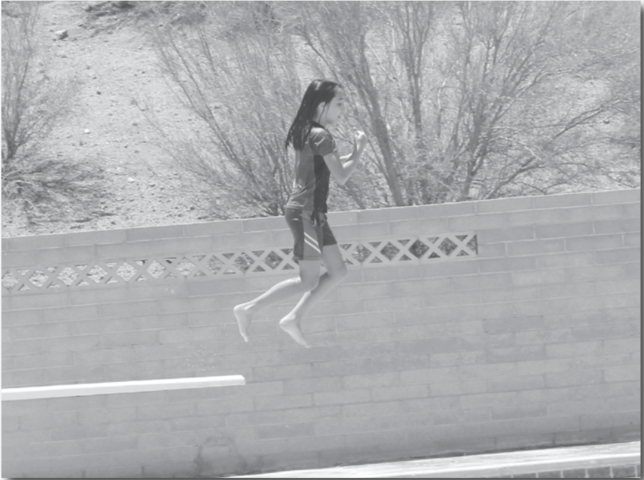
The Mammoth Pool is open. On July 4th, the Town of Mammoth offered free swimming. As hot as it was, folks kept cool in the pool.