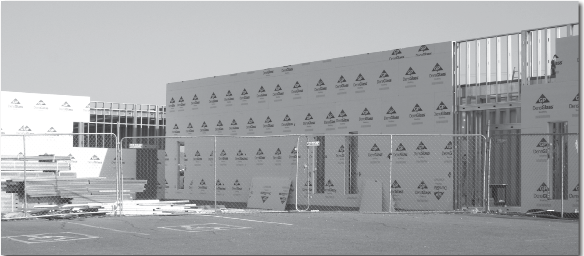
The walls are going up on the new Kearny clinic this week.