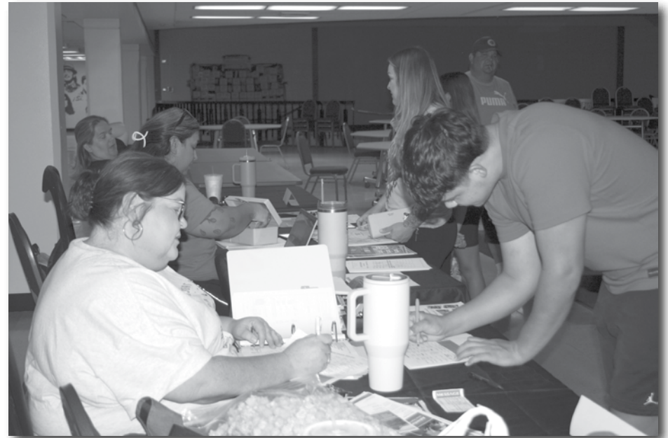
Parents were registering their children for the new school year at the Hayden-Winkelman School District Wednesday and Thursday last week.