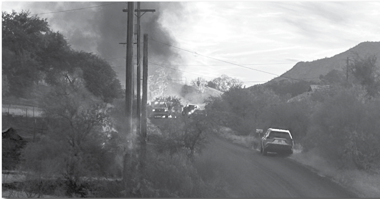
The road was closed during the recent Simmons Fire.