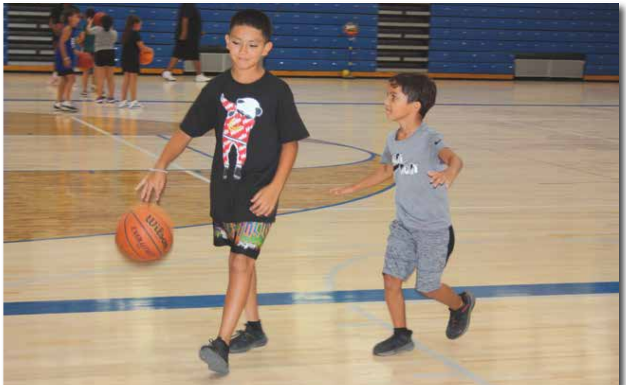
Kids have fun learning the fundamentals of basketball at the Hayden Schools and Asarco Basketball Summer Camp.