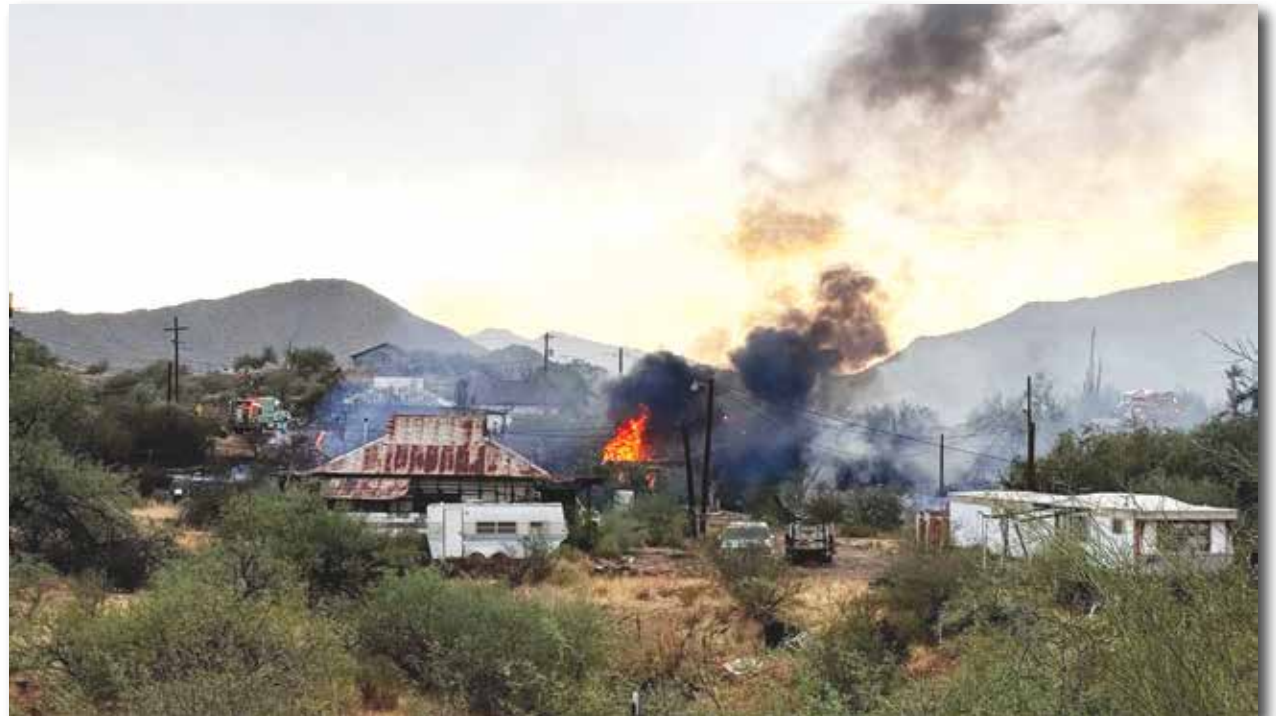
The Kearny Volunteer Police Department played a huge roll in containing the Dew Fire in Riverside.