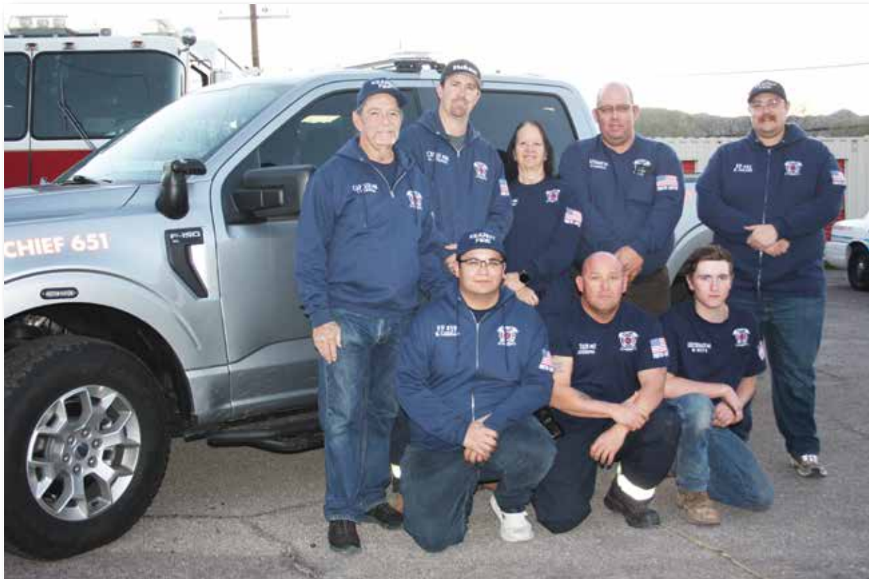
Kearny’s volunteer firefighters lay it all on the line for their community.