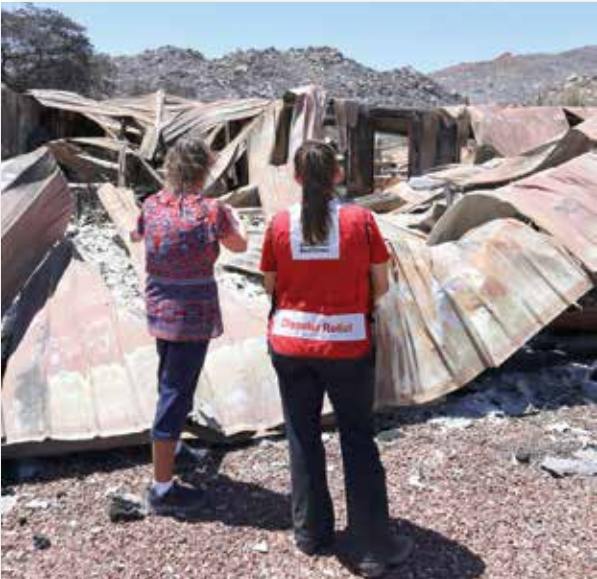
A Red Cross responder talks with a disaster victim.