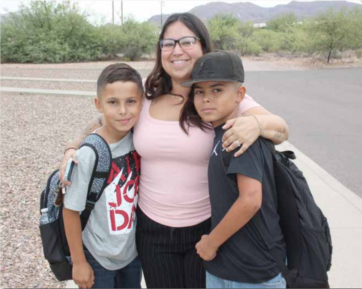
Another summer moving on and another school year near begun. Are you excited, kids? Ready to hit the books? Guess what, kids? Your parents are super-excited that you are heading back to school! Ready or not, here it comes. Ray Schools had its first day of school on Wednesday, July 16. It was an early start for the kids of the district.