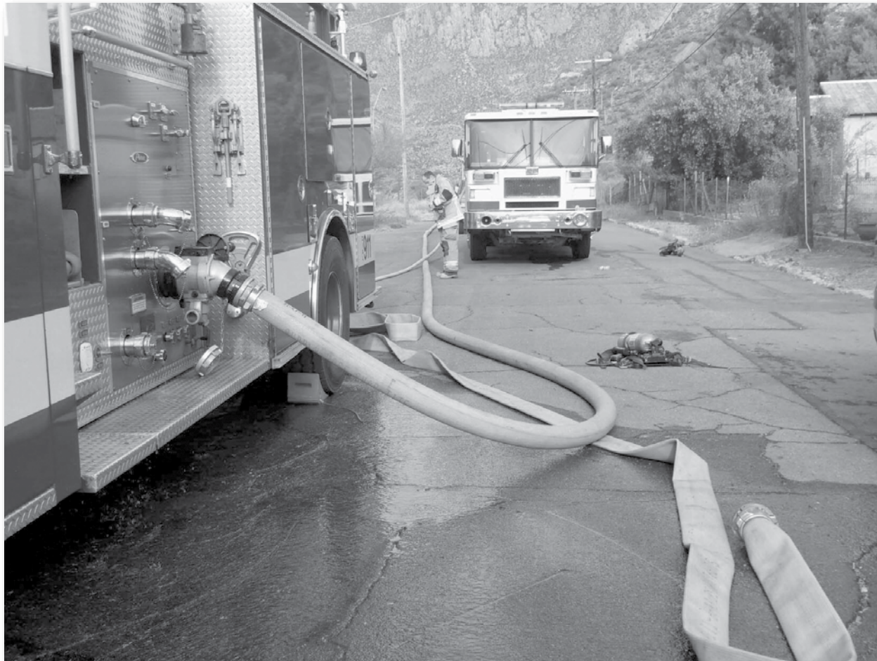
Superior Firefighters now have a group of volunteers to provide support when they are called to the scene of a fire or accident. The Volunteer Fire Corps is an auxiliary to the fire department.