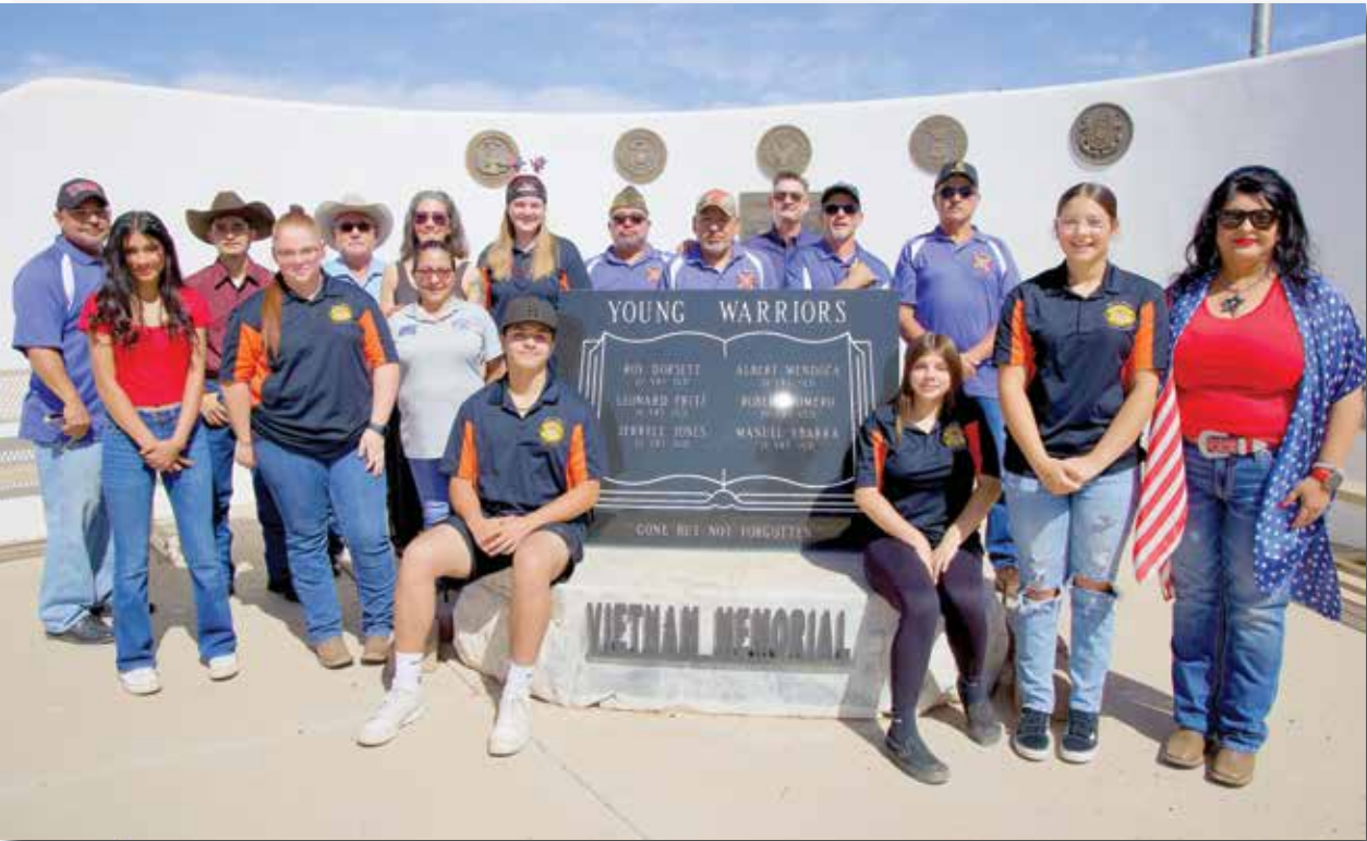
VFW members and the youth involved in the Memorial Day ceremony.