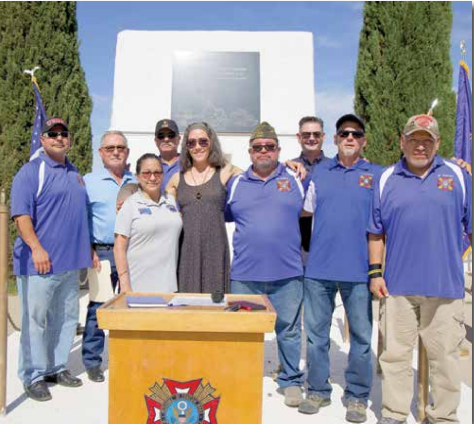
VFW Post 3584 members.