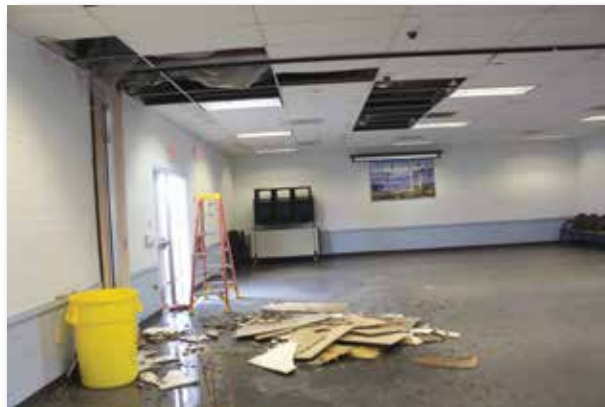
A microburst Thursday left a mess in the San Manuel Community Center as part of the roof was blown away.