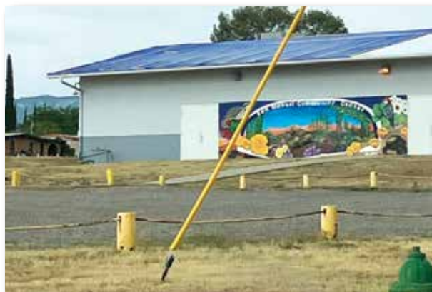
While the mess had been cleaned up, the roof atop the San Manuel Community Center was still covered with a tarp on Saturday.