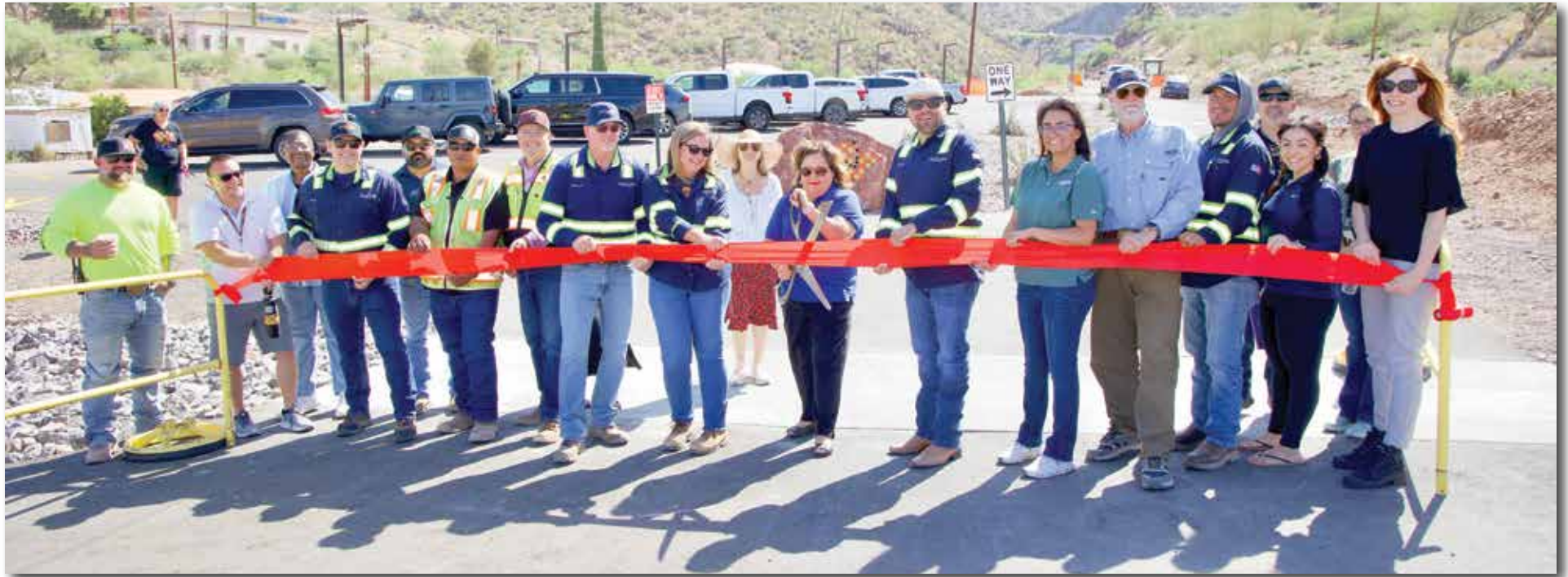
The Queen Creek Trailhead parking area officially open.