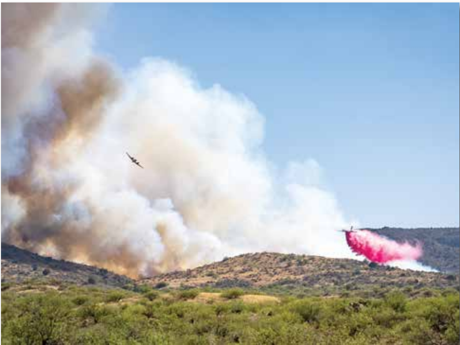
Multiple aircraft respond to the Cody Fire near Oracle, AZ the afternoon of May 21, 2025.

A lot of armchair quarterbacking always follows an event of this magnitude. Why didn’t they use this company? Why didn’t they tell us more about what was going on? Why did it take so long? The list goes on. Here are some things to counter those