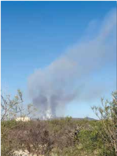
Cody Fire smoke plumes seen from San Manuel, AZ on the morning of May 22, 2025, seemed reduced compared to the evening before.

if members of the community were willing to participate in the program. The fire districts of Mammoth and San Manuel are certainly up to the task. It is hoped that a community meeting will be held soon to further address this idea for San Manuel.