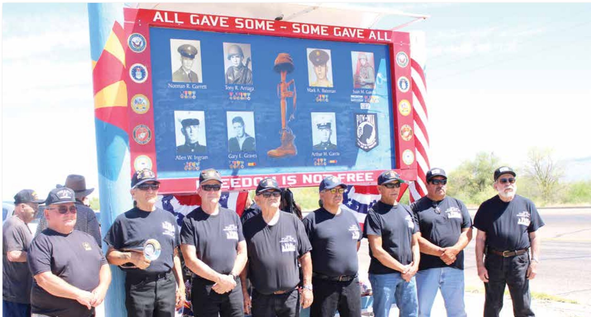
Members of the Tri-Community VFW in front of the Vietnam Memorial in San Manuel.