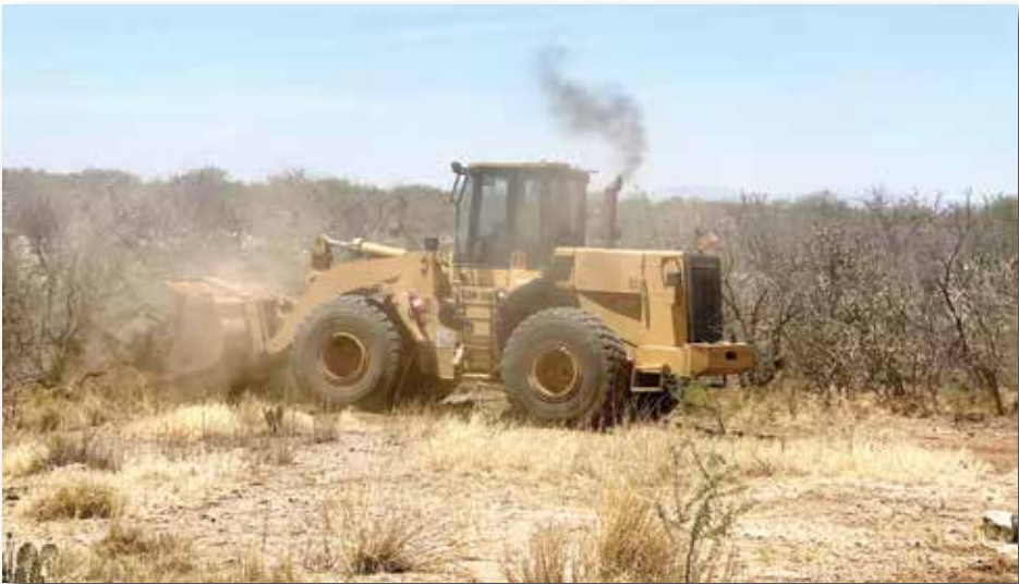
BHP crew members were busy during the recent fires as they created and widened fire breaks around San Manuel. They have been clearing areas all around the area.

channels and can be sent according to any geographic boundaries necessary or be used as a countywide message blast. Be sure to register for the Pinal Emergency Notification System (PENS). Once you register and create a profile, you can select your preferences for how and when you will receive alerts. Please register at https://pinalcounty.genasys.com/portal/en . The San Manuel Revitalization Coalition has been working with the local fire district as well as state forestry and fire management on the needed steps that are required for San Manuel to become a Firewise Community. It is hoped that community members will attend upcoming meetings that will be announced in the future.