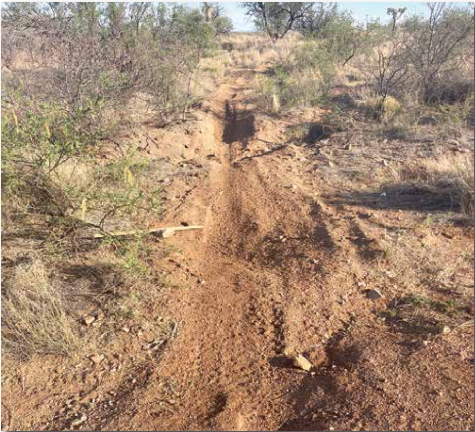
Single-track areas are evident in the area around San Manuel. Ruts and divots could be reduced if erosion control techniques are used after races.

Input was sought from BHP and MSMUSD Community Schools. No response was received at the time of printing.