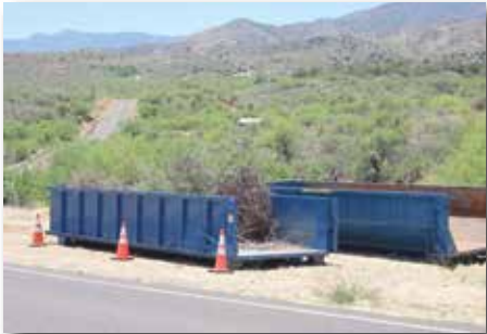
Dumpsters have been placed in the Campo Bonito and Cody Loop areas for fire clean up.