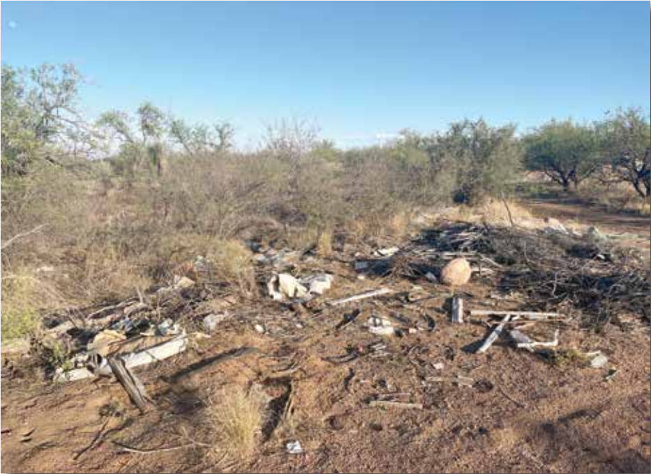
Not all damage is from motorcycles or other off-road vehicles. Some folks unfortunately use the desert as a place to dump their trash and debris.