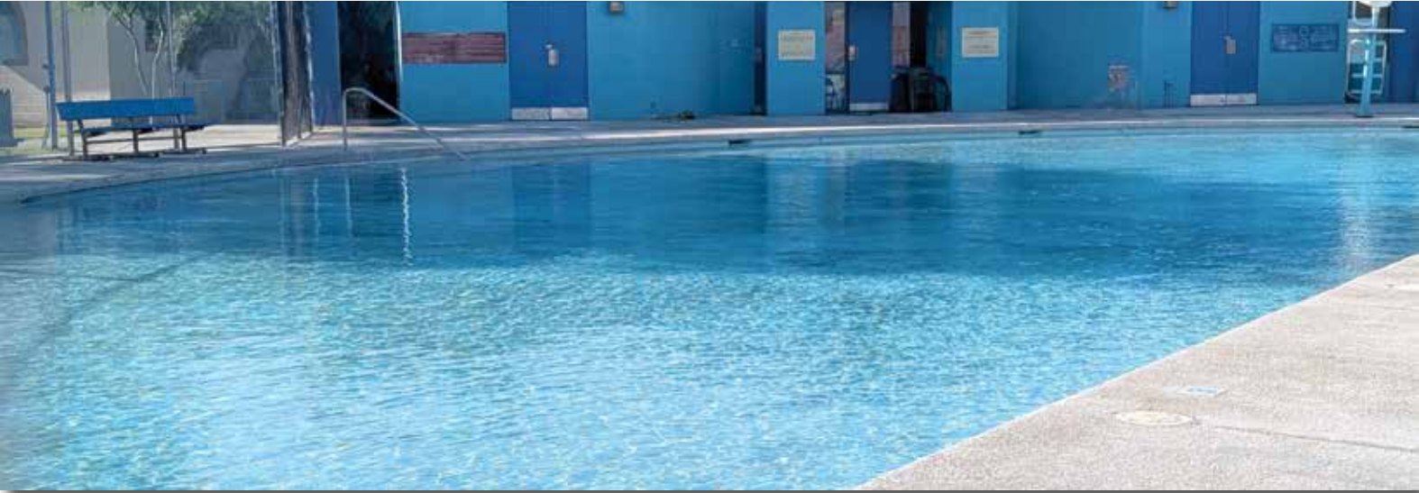
Cool and refreshing, the Hayden Pool is open for swimmers of all ages.

For more information, contact the Town of Hayden at (520) 356-7138.