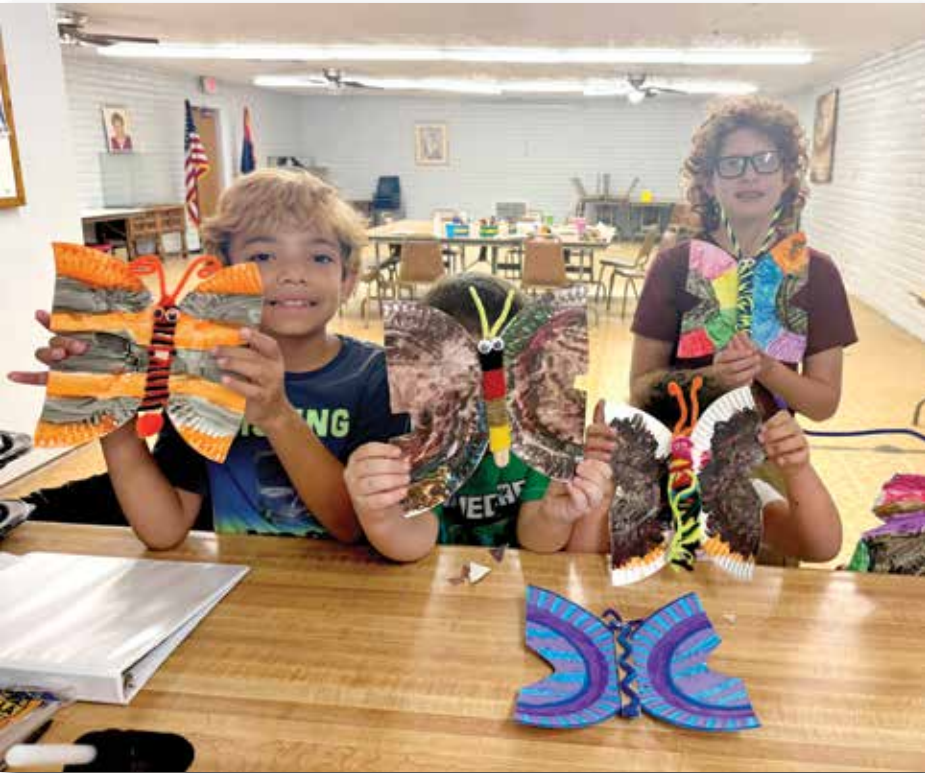
Kids show off their artwork at the Town of Kearny Summer Camp.