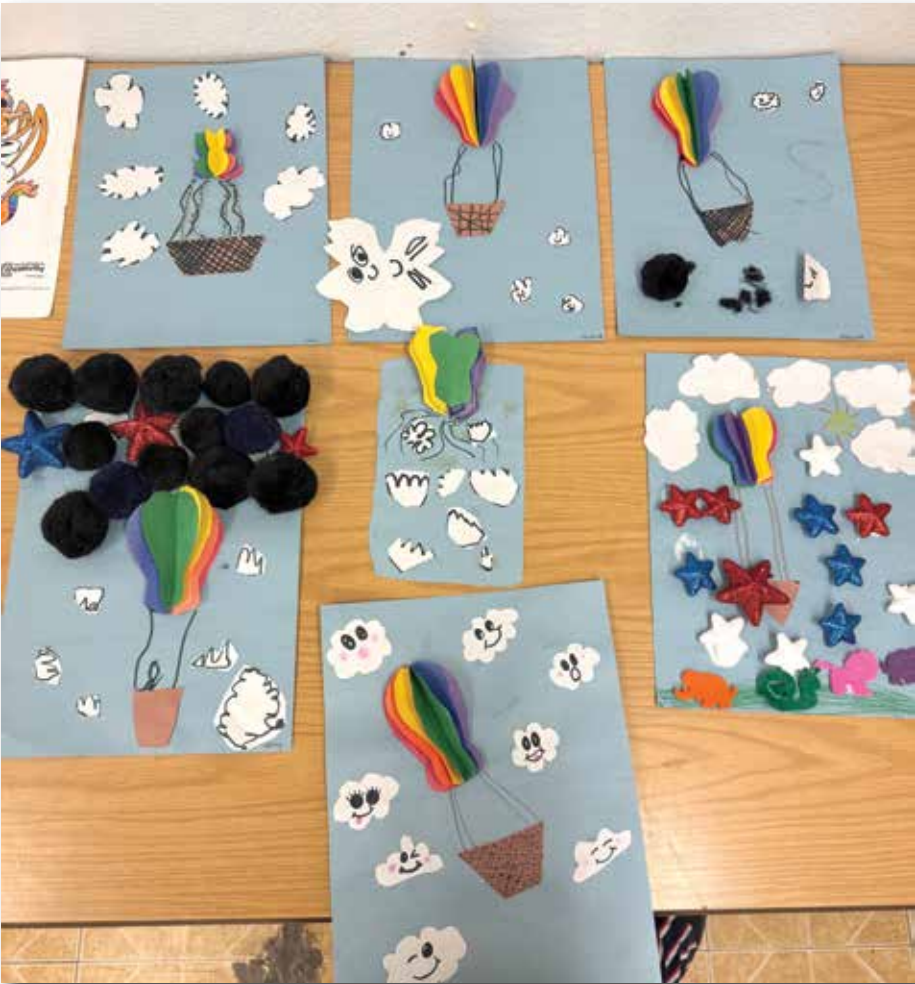
A closer view of the artwork at the Town of Kearny Summer Camp.