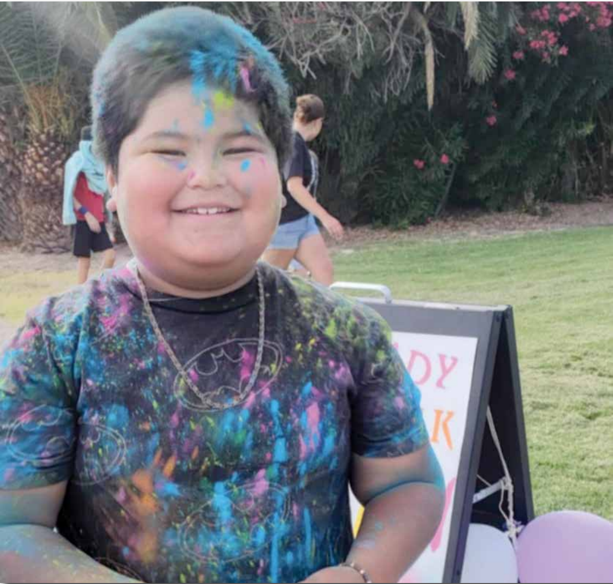
Covered in chalk dust, this young man celebrates the start of summer at the Color Run.