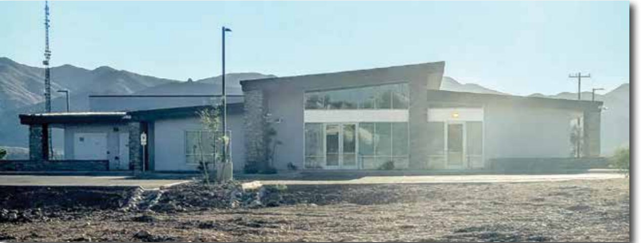
Now open: The Kearny Clinic is open to see patients.

For more information regarding the standard of care available at the new clinic, you can contact the Kearny Clinic at (520) 363-5573.