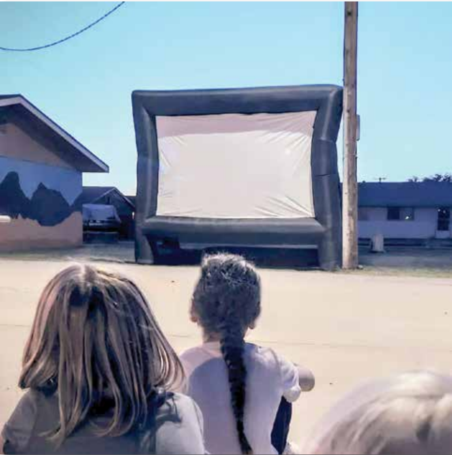
Movies in the Park are back for the summer! Head over to Hubbard Park on Tuesday and Thursday nights.

All movies will start at 8 p.m. The Town of Kearny is also offering a special summer program just for kids ages 5-12. Session one is nearly over, but there are two more sessions available: June 16-26 and June 30-July 10. Cost is $80 per child or $120 for two children (immediate family only) or $150 for three children. Camp is held Monday through Thursday, 8 a.m. to 3 p.m. Register at the Town Hall, 374 Alden Rd., Kearny. For more information, or to find out more about upcoming events, you can contact the Town of Kearny at (520) 363-5547.