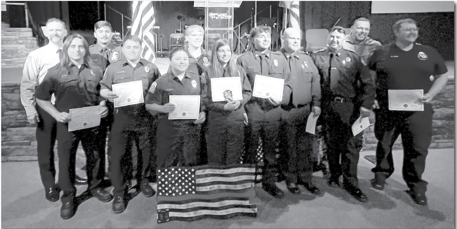
Copper Corridor Fire Districts Cadets recently completed the requirements for Firefighter I and II.

Thank you to each Cadet for wanting to make a difference in the communities you live in and now serve. Thanks for sharing your heart with us all.