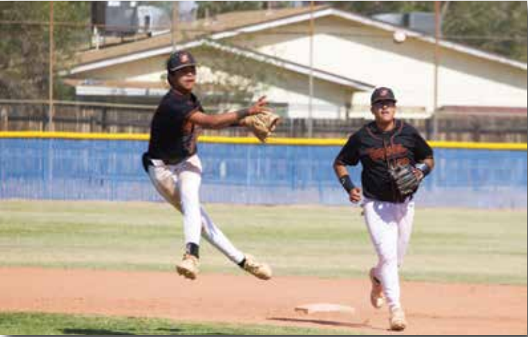
A Superior player throws the ball while another one comes in for the assist.

Good luck to all our athletes in the quarterfinals. And to those whose seasons have ended, congratulations on a successful spring. We look forward to seeing you back on the diamonds next year.