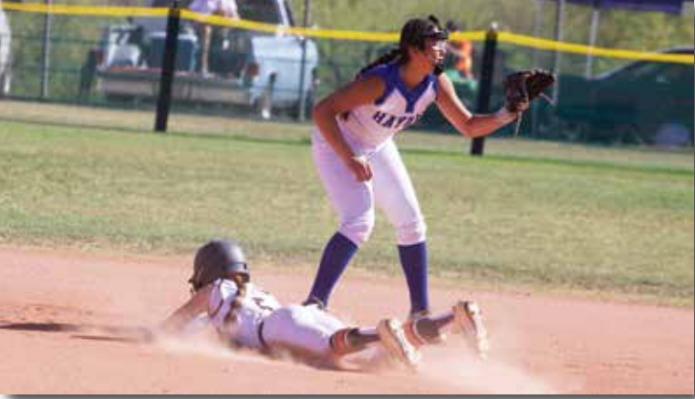
A Superior player slides into base while a Lady Lobo tries to tag her out.