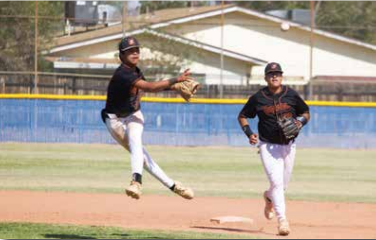
A Superior player throws the ball while another one comes in for the assist.

Good luck to all our athletes in the quarterfinals. And to those whose seasons have ended, congratulations on a successful spring. We look forward to seeing you back on the diamonds next year.