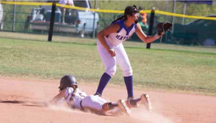
A Superior player slides into base while a Lady Lobo tries to tag her out.