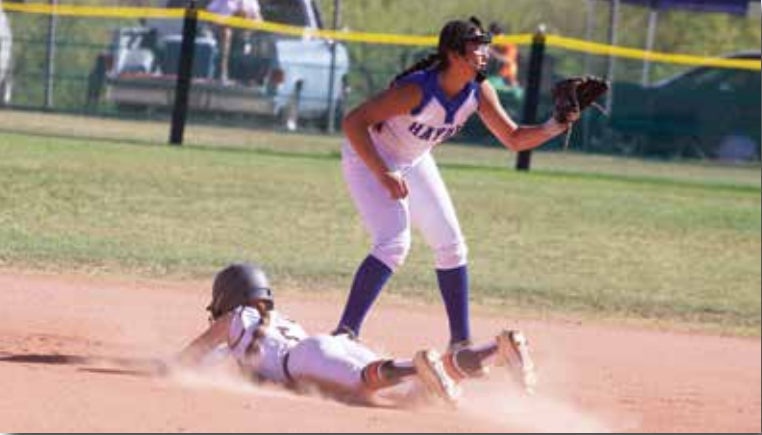
A Superior player slides into base while a Lady Lobo tries to tag her out.