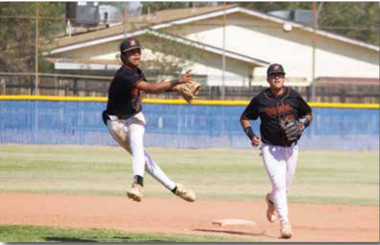
A Superior player throws the ball while another one comes in for the assist.

Good luck to all our athletes in the quarterfinals. And to those whose seasons have ended, congratulations on a successful spring. We look forward to seeing you back on the diamonds next year.