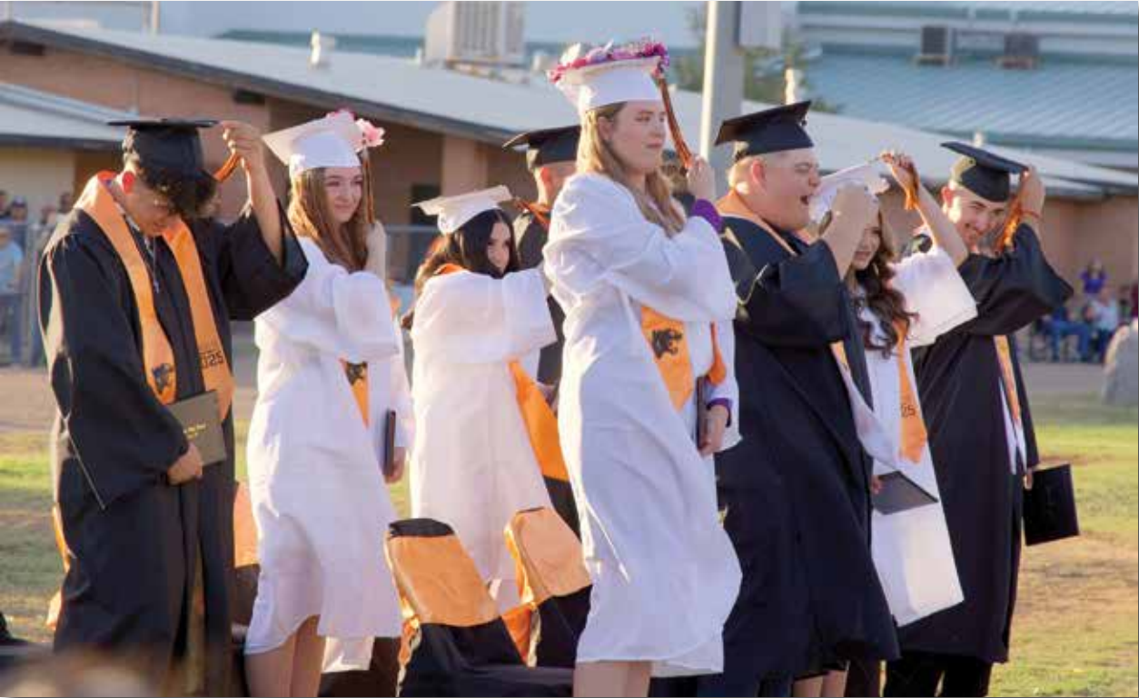
Turning of the tassels.