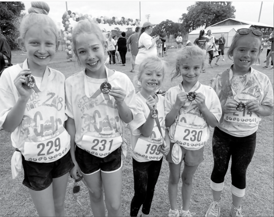
Hayden Library’s reading program will start off with a color run.