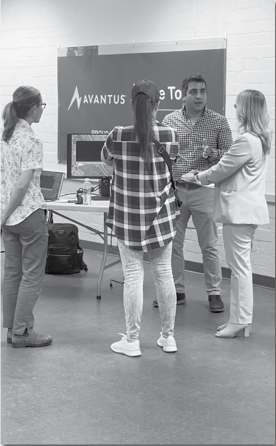
Avantus staff answers questions during the recent Ore Town Solar Open House.