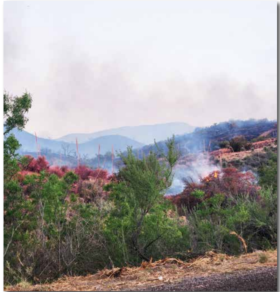
The Cody Fire burns near Oracle.