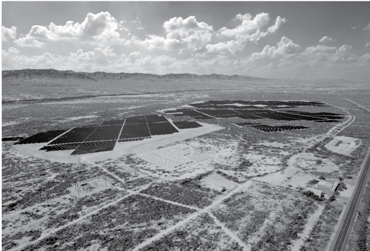
Avantus simulated overview image of planned location.

The Board of Supervisors will review the case and