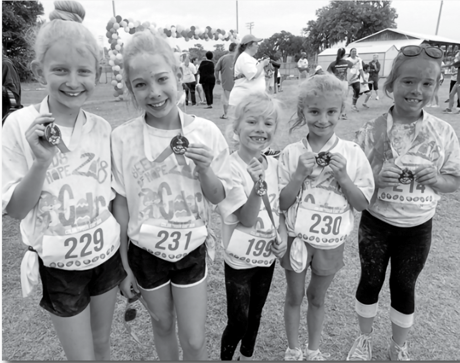
Hayden Library's reading program will start off with a color run.