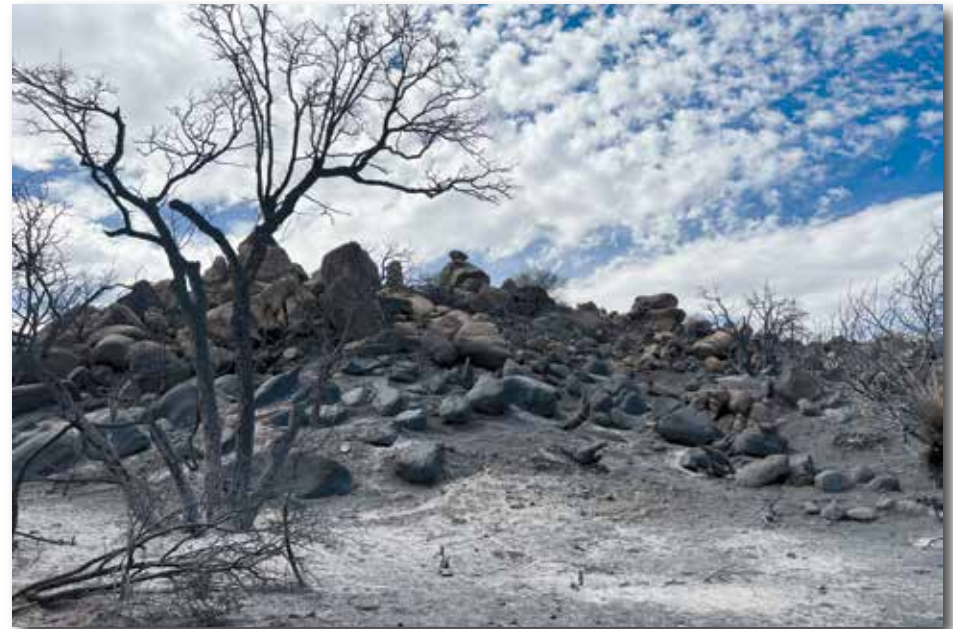
Aftermath from the Cody Fire.