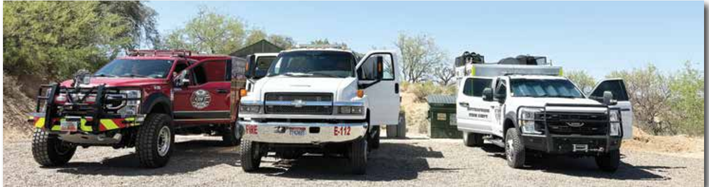
Fire crews camped at the Oracle Community Center.