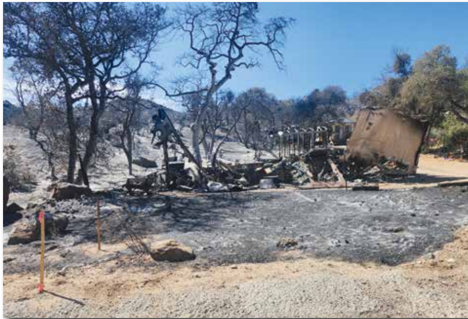
Damage from the Cody Fire.