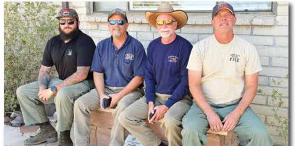
Fire crews take a break at the Oracle Community Center from fighting the Cody Fire.