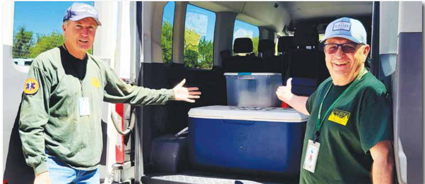
Oracle CERT members deliver ice to the firefighters working the Cody Fire.