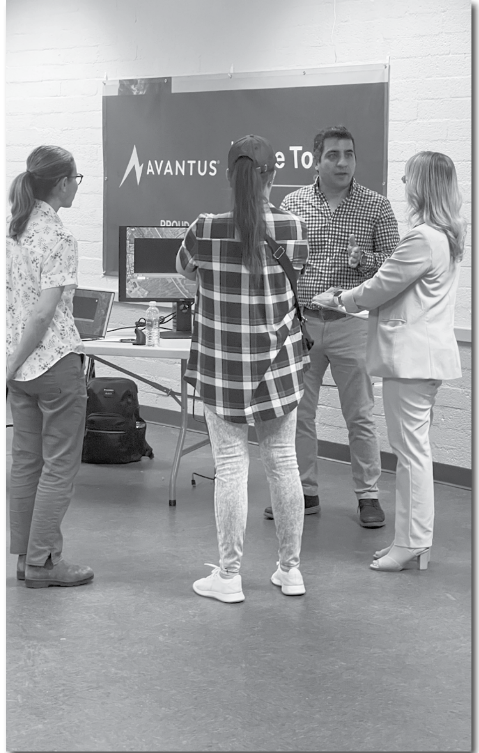
Avantus staff answers questions during the recent Ore Town Solar Open House.