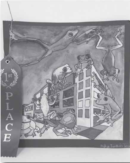
Two-Point Perspective by Kylie Jenkins