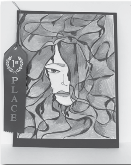
Neurographic Lines by Landree Skaggs