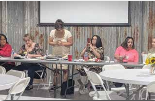
Members of the Copper Basin Chamber enjoy pie and ice cream before a meeting.

April 27 – May 3: Calls not listed include animal complaint (2), 911 open line (2), welfare check (1), citizen assist (2), agency assist (1), unwanted subjects (1), snake call (1), fingerprints (1), abandoned vehicle (1), traffic (3) and fire check (1).