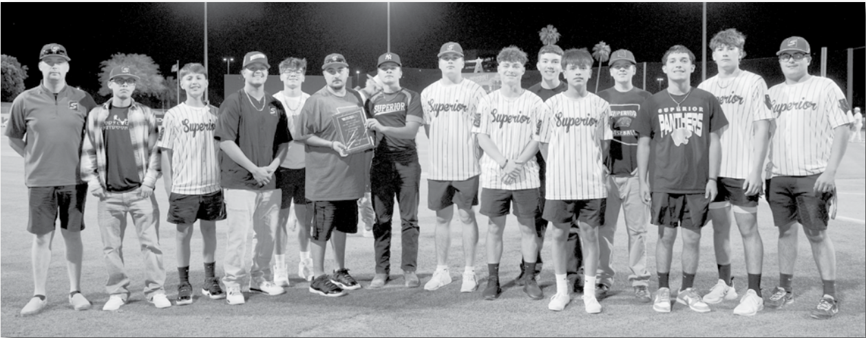
Superior's baseball team was honored at the championship game Saturday with the 1A Sportsmanship Award.