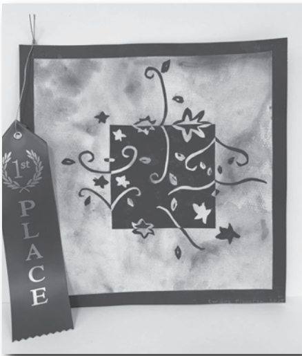
Japanese Notan Design by Corrine Figueroa