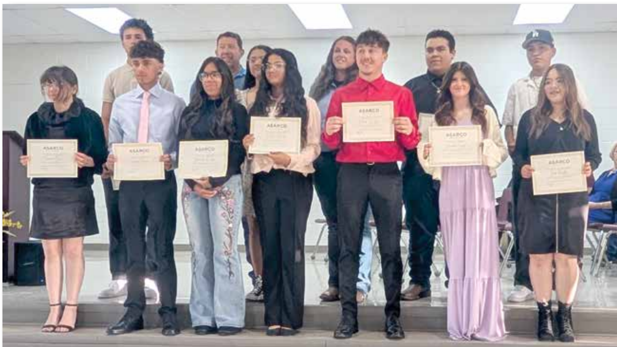
Ray High School seniors receive their scholarships from Asarco.