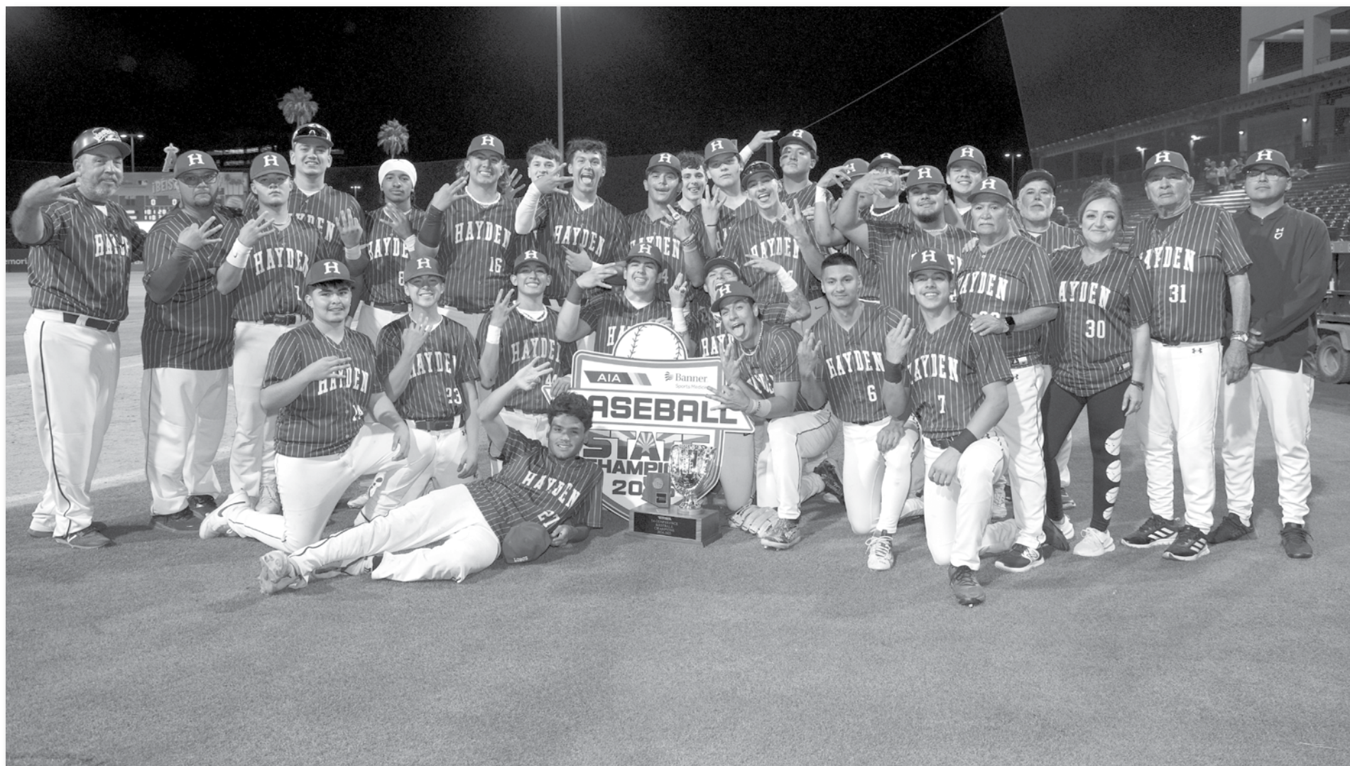
Hayden Lobos win a third straight championship. Congratulations!