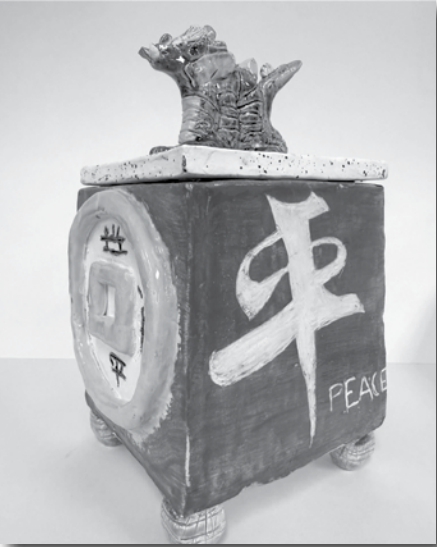
Ceramic Cookie Jar by Seth Wade