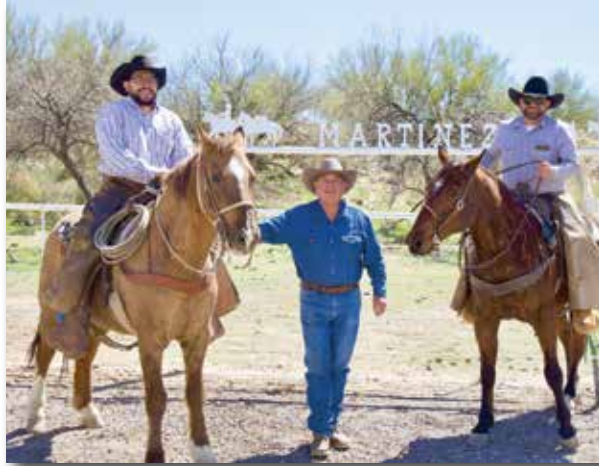
Best of America by Horseback visited the Martinez Ranch in Superior.

The popular RFD TV television show Best of America by Horseback show recently filmed of an episode of their popular equestrian-themed television show camped at the Martinez Ranch in Superior. The location of the Martinez Ranch allowed them centralized access to many of the