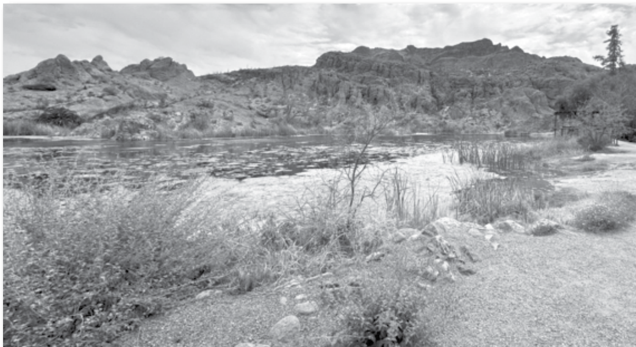
Ayer Lake at Arboretum is a safe haven for an endangered fish.

Desert pupfish are small (usually less than three inches in length) and are silvery gray with the females displaying dark markings on their sides. During breeding season, males turn bright blue with yellow tails and aggressively defend their territory. Desert pupfish are evolutionarily suited to harsh climates, able to tolerate both extremely hot and cold temperatures, as well as low oxygen, high-salinity water.