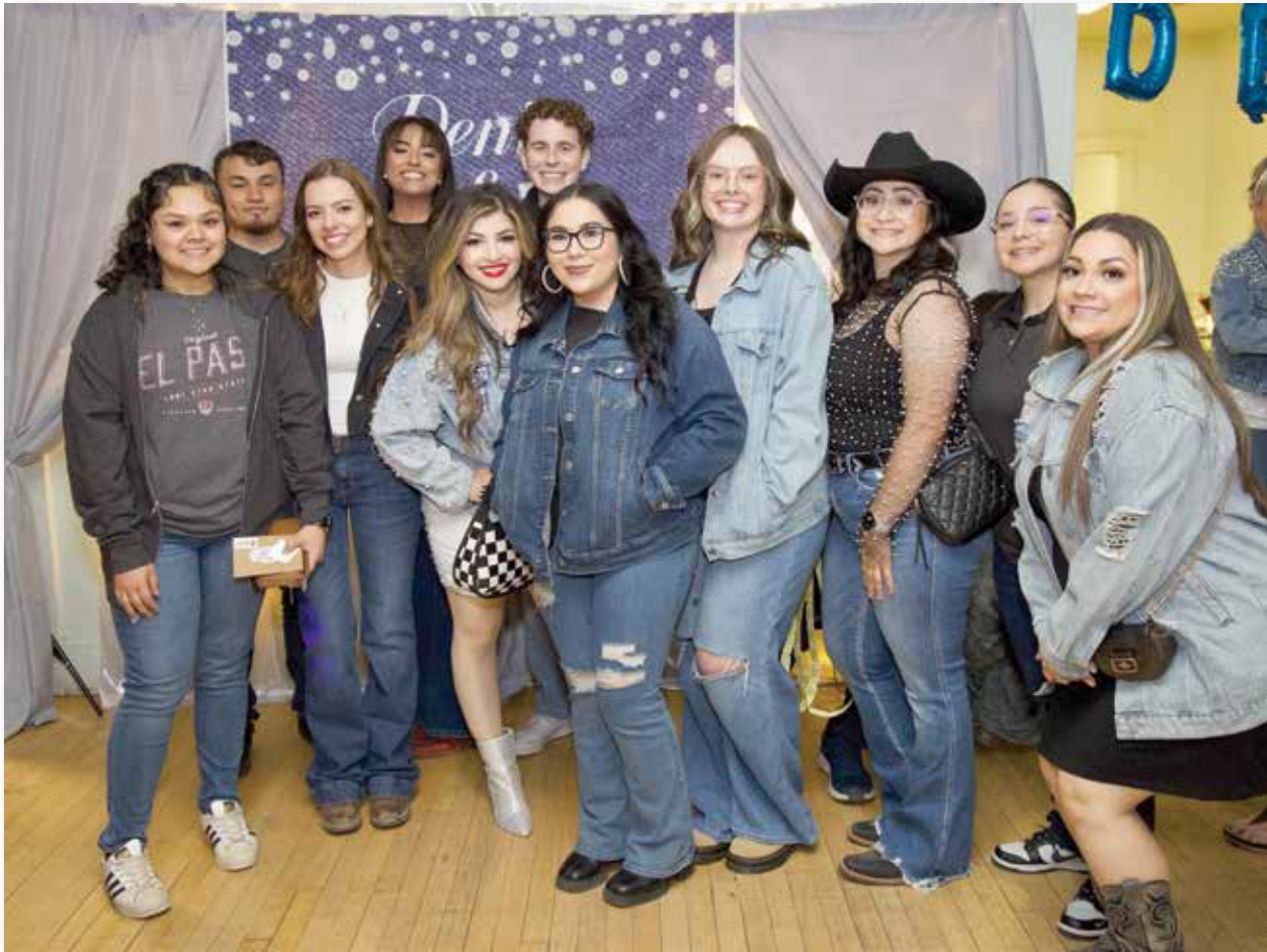
SHS Alumni Optimist laptop and scholarship winners attending Denim and Diamonds casino night.