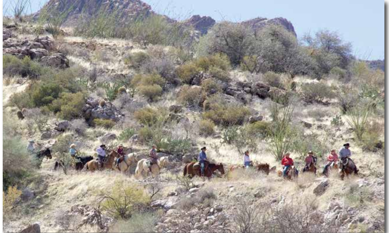
Best of America by Horseback took a trail ride on the LOST.

Close to two dozen horseback riders from across Arizona and the United States traveled to Superior to participate in the show. The show featuring Superior is expected to air in early Summer. RFD TV is a cable news network that focuses on agricultural subjects and rural living programming.