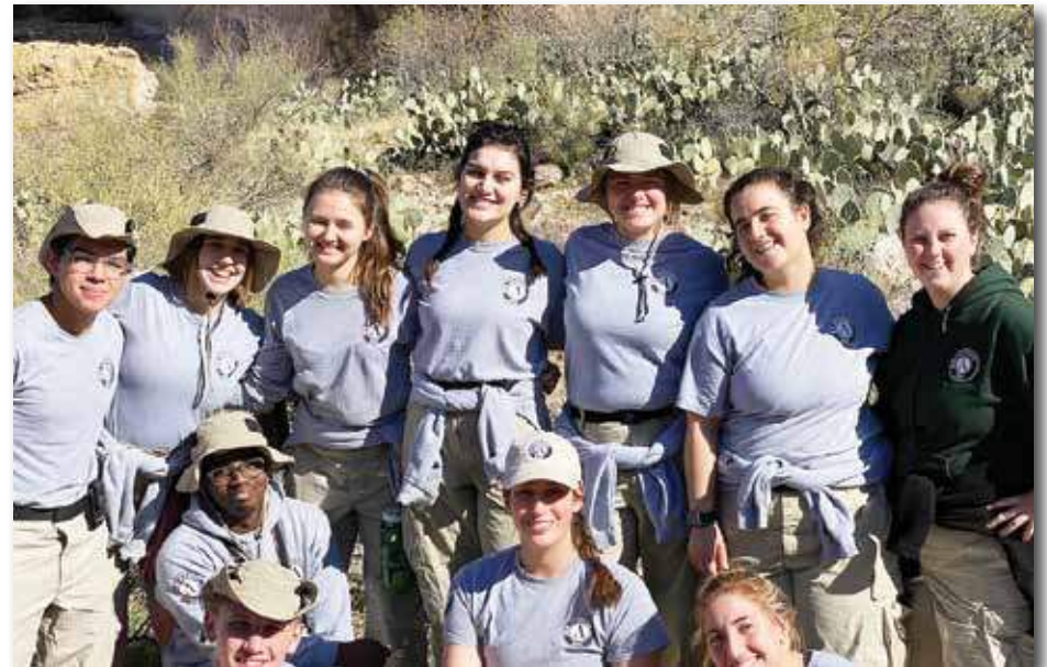
Above are pictured members of former AmeriCorps teams who worked in and around Superior.