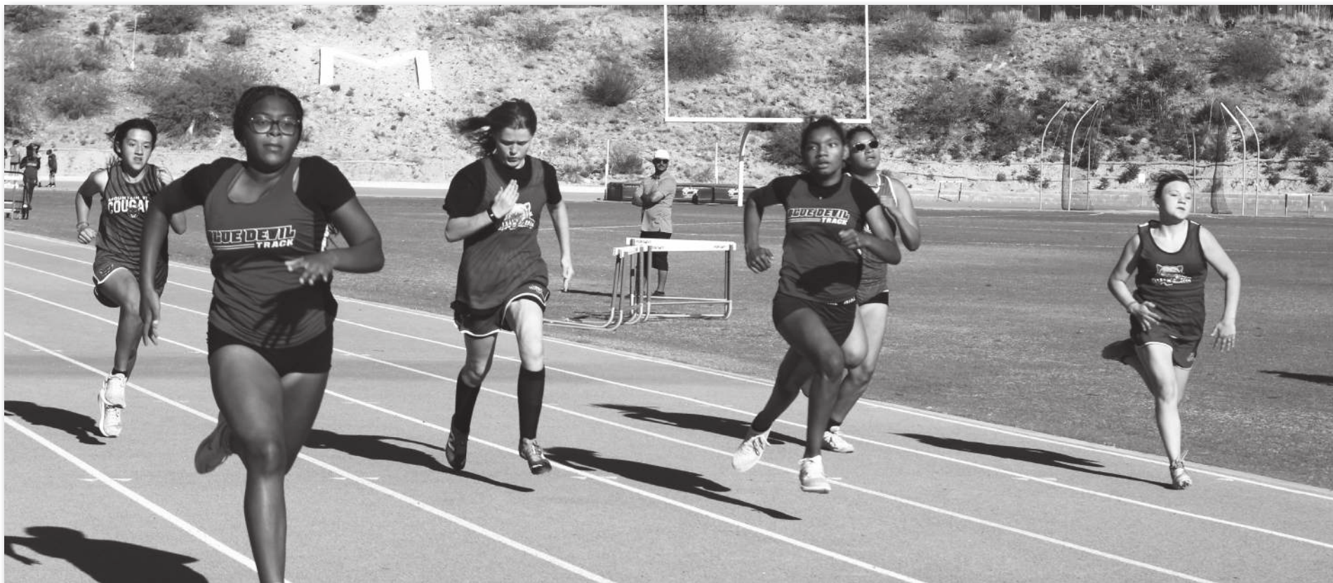
Ray Jr. High and Mountain Vista School athletes compete at the Central Junior High League Track and Field Championships in Miami.