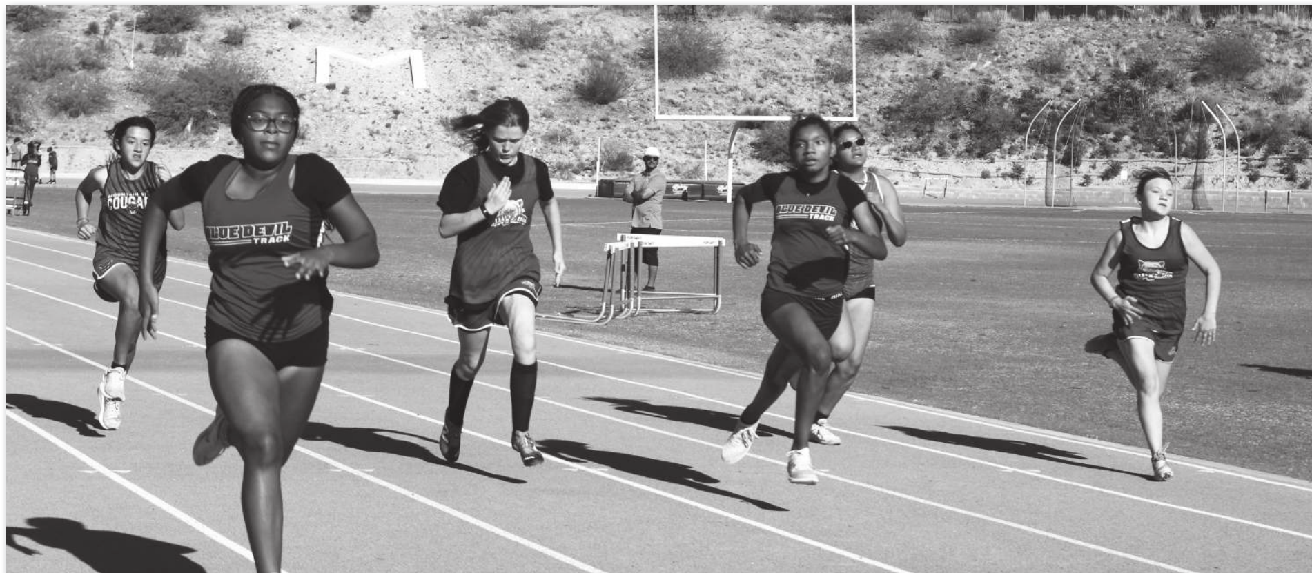
Ray Jr. High and Mountain Vista School athletes compete at the Central Junior High League Track and Field Championships in Miami.