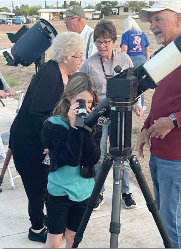
Stargazers of all ages were on-hand to view nebulae, planets and more.