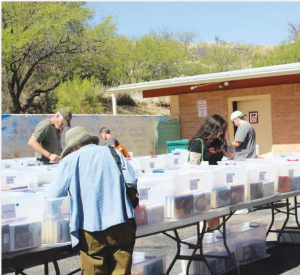
The Oracle Public Library held its semi-annual book sale Saturday to the delight of book lovers.