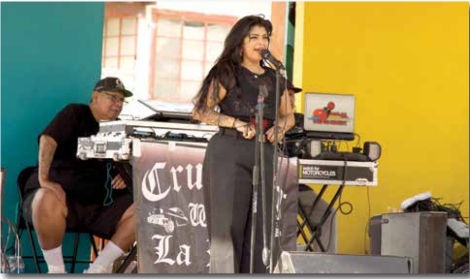
Lowrider Tour Artist Lady Old Skoo