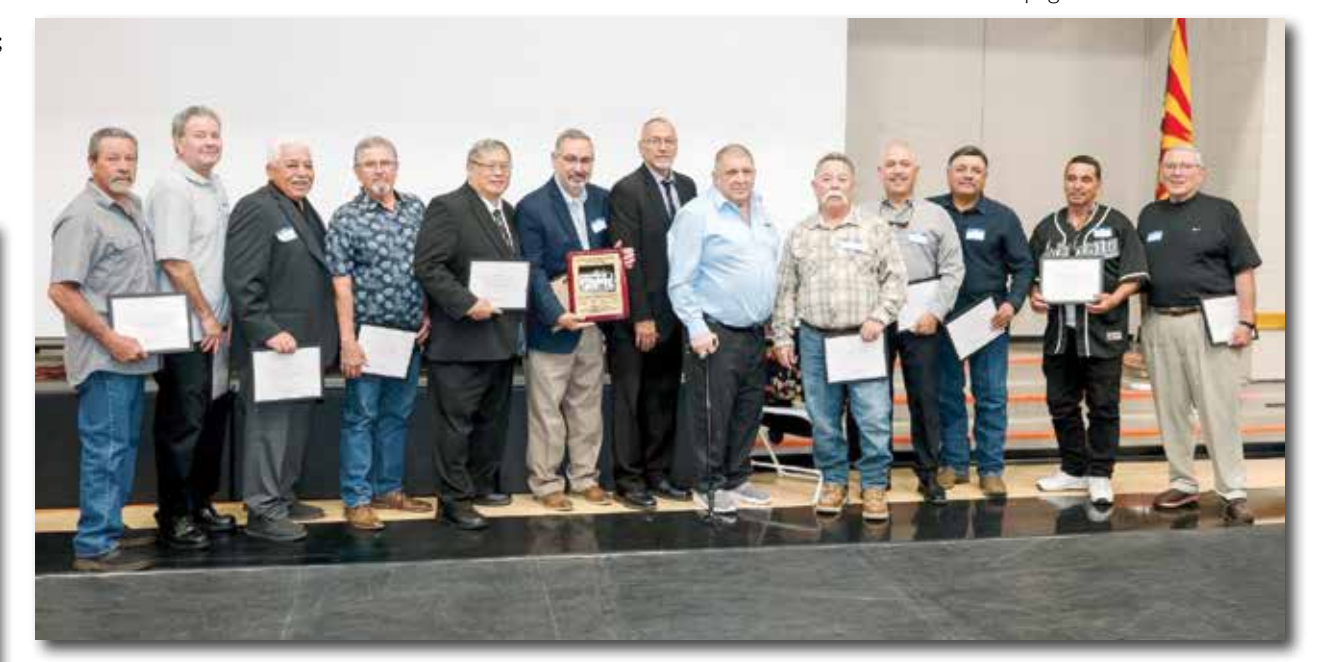
Members of the 1975 Class B Baseball State Champions recently inducted into the Superior Hall of Fame.