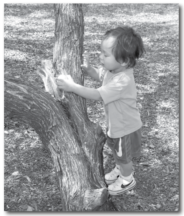
Superior hosted its Easter Egg Hunt last week. But EB will be visiting Kearny, Hayden and San Manuel later this week.

Securities offered through Osaic Wealth , Inc. , member FINRA/SIPC. Osaic Wealth Inc. , is separately owned and other entities and/or marketing names, products or services referenced here are independent of Osaic Wealth , Inc. Securities and investment advisory services are offered through Arizona Financial Services.