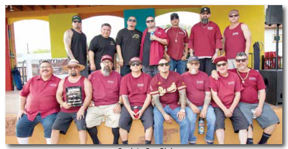
Society Car Club