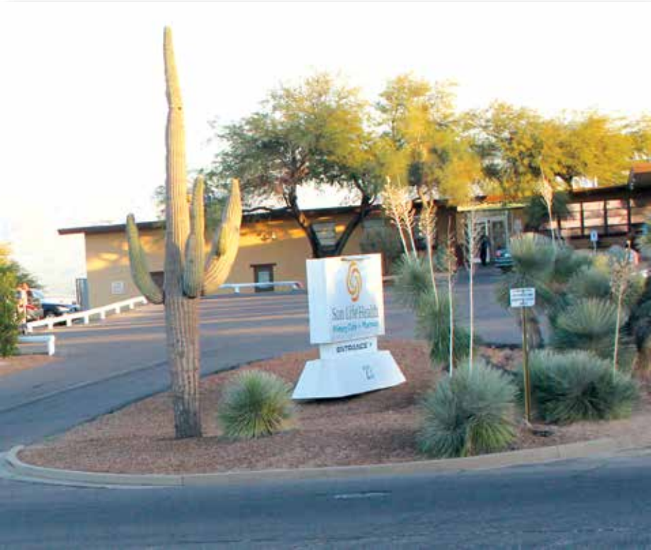
Sun Life will close the San Manuel office on May 5.

Due to the current challenges within health care, alongside the increasing costs associated with maintaining the aging facility, Sun Life Health has made the difficult decision to temporarily close its San Manuel office and transfer care to Oracle. This decision was not made lightly and comes after much consideration and exploration of alternative options. Sun Life Health deeply values the trust and relationships built with its patients in San Manuel over the past 25 years and wants to ensure that relationship continues.