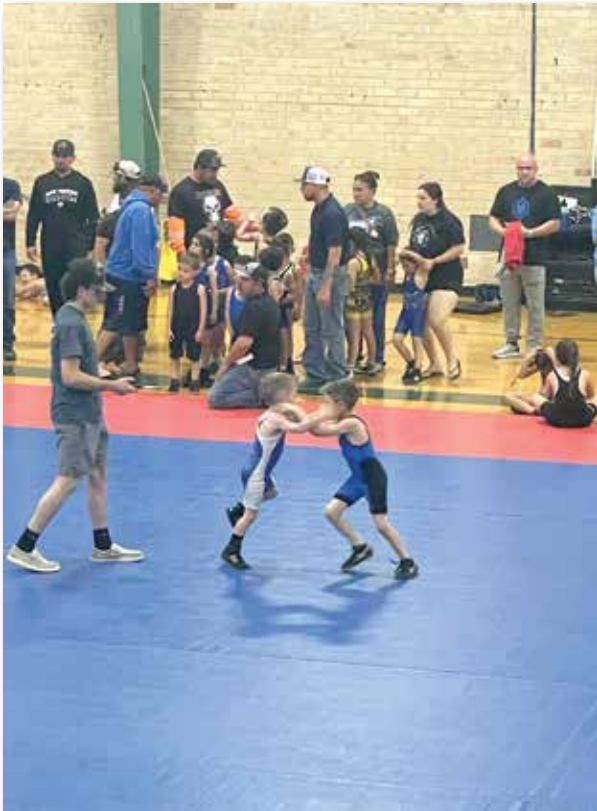
Scenes from the Mammoth-San Manuel Community Schools Wrestling Tournament held on April 8, 2025.