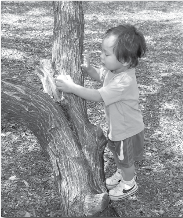
Superior hosted its Easter Egg Hunt last week. But EB will be visiting Kearny, Hayden and San Manuel later this week.