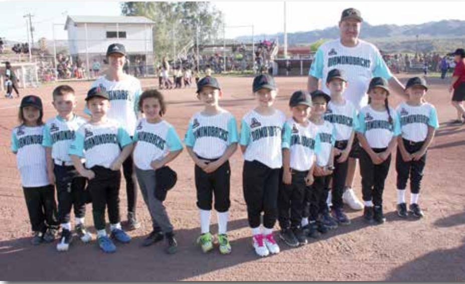
The Kearny Little League held their opening ceremonies for the T-Ball and Coach Pitch leagues Monday. The players were introduced in their new uniforms to start the season.