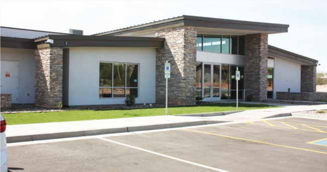
Cobre Valley Regional Medical Center Kearny Clinic will be having an open house Monday, April 21, 5-7 p.m. at 100 Tilbury Drive. They invite everyone to come and tour the brand-new clinic and learn more about the services that will be offered.