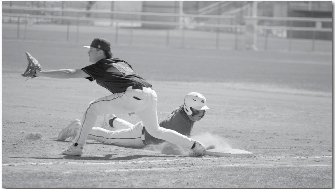
A Hayden player slides into base as a Panther reaches to catch the ball. The teams played during the 38th Annual Joe Padilla Baseball Tournament in Florence.

San Manuel faced off against Morenci during their second game of the consolation bracket. The Miners claimed the win with a close 2-1 final score. Making it into the consolation bracket championship game, San Manuel played against Santa Cruz Valley. Playing another close