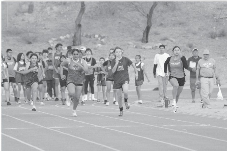
Ray Junior High School and Mountain Vista School in Oracle participated in a track and field meet in Miami last week.

HAVE A SAFE AND FUN-FILLED WEEKEND AT KEARNY PIONEER DAYS!