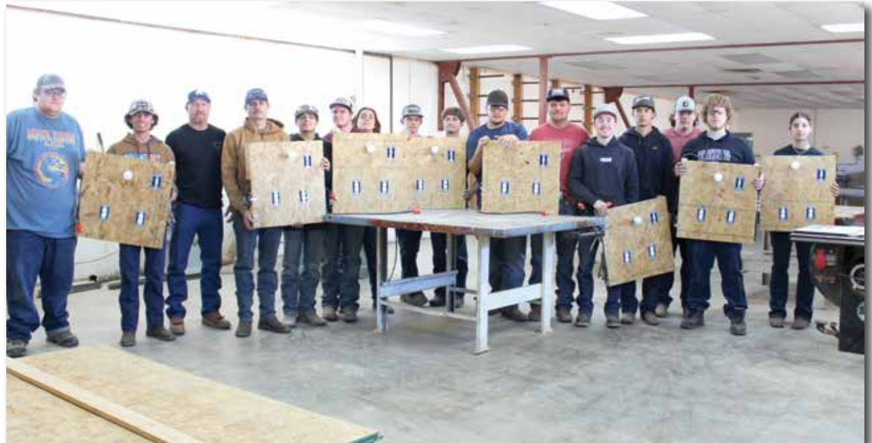
Ray High School has expanded its construction program for CTE students.