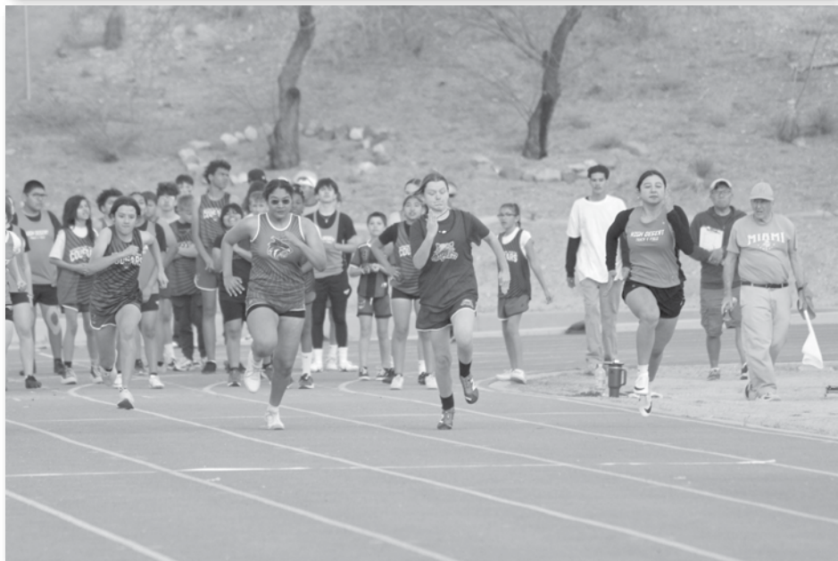
Ray Junior High School and Mountain Vista School in Oracle participated in a track and field meet in Miami last week.

HAVE A SAFE AND FUN-FILLED WEEKEND AT KEARNY PIONEER DAYS!