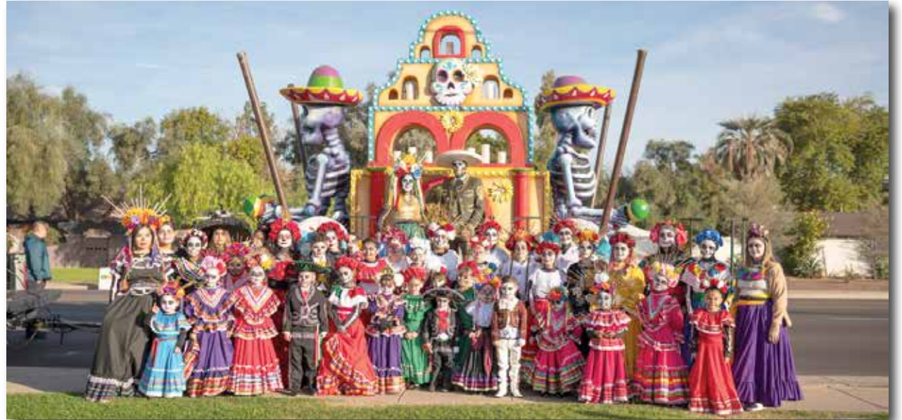
Superior Dance Company will be performing at a Suns game and at the Apache Leap Mining Festival.