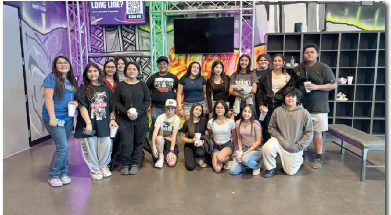
Students who achieved the second quarter and first semester honor roll at Hambly Middle School enjoyed an afternoon of jumping at Elevate in Queen Creek.