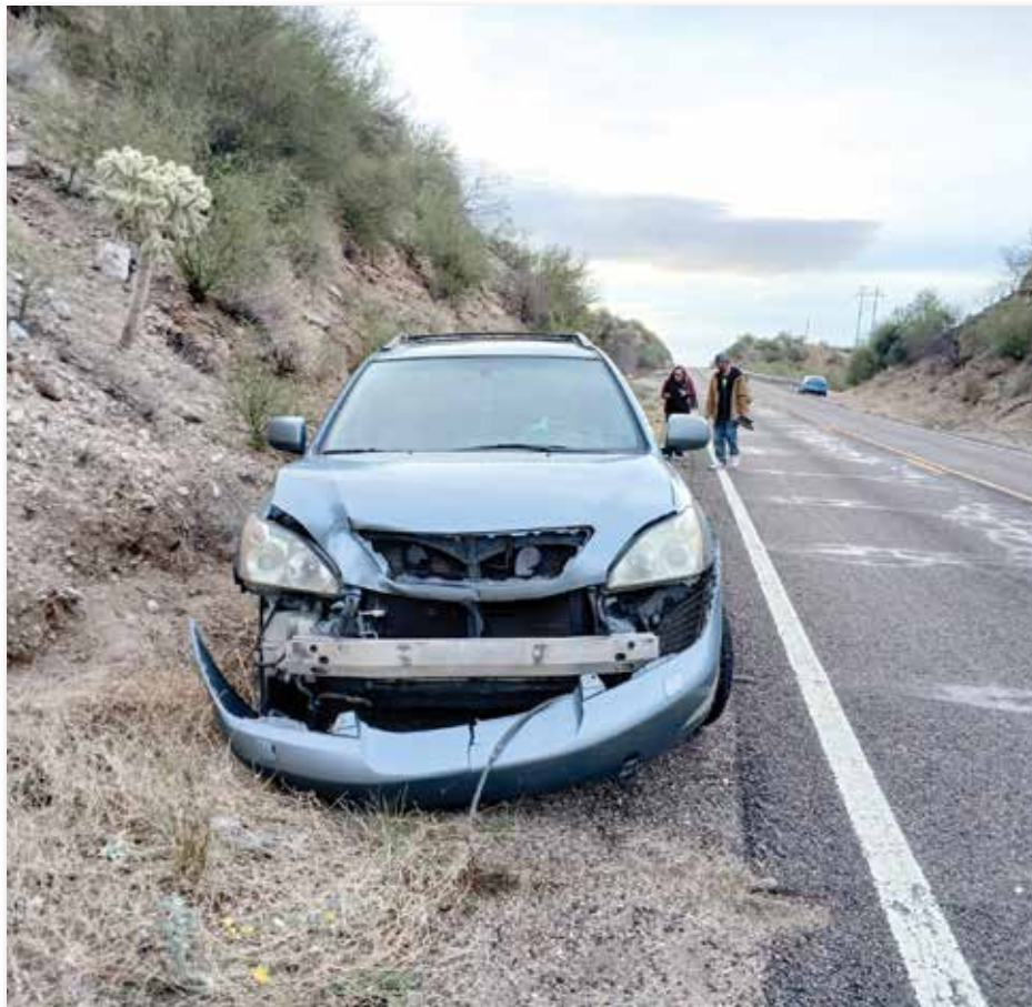
This vehicle hit a deer just outside of Kearny on Highway 177 going to Superior Friday morning. There were no human injuries, but the deer didn't fare so well.