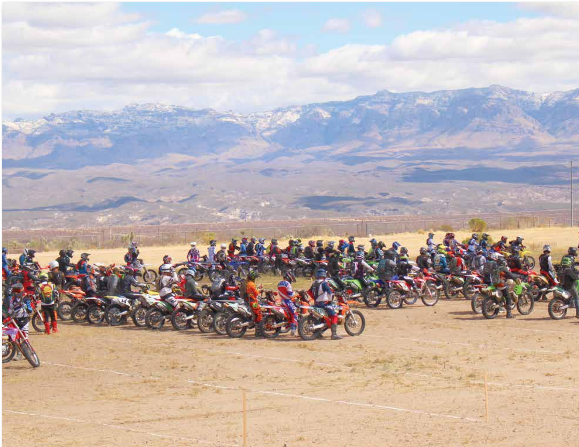
The motorcycles roared at the annual Copper Classic held in San Manuel Saturday.