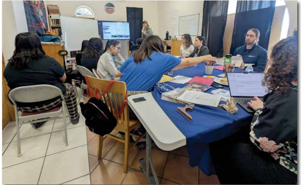
University of Arizona's Teen Advisory Board meets at the Hayden Library.

For more information, visit the program's website at https://steamaction.arizona.edu , or contact the Hayden Library.