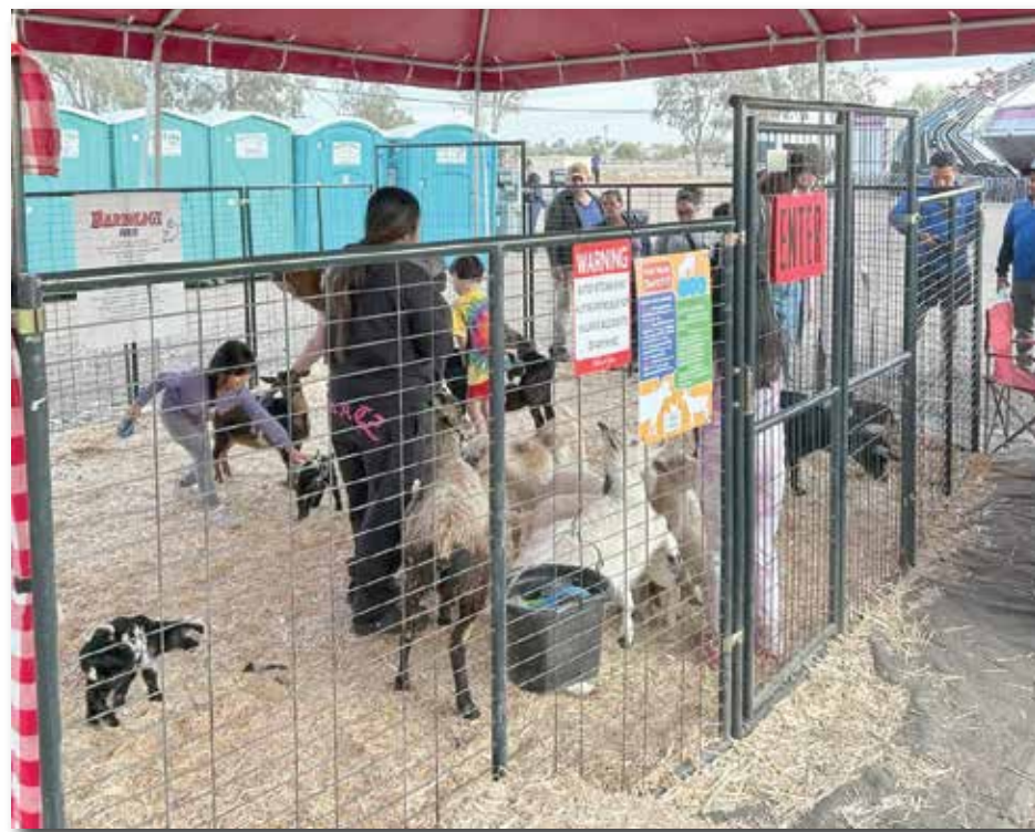
Children and adults alike had fun at the Barnology Petting Zoo at Pioneer Days.