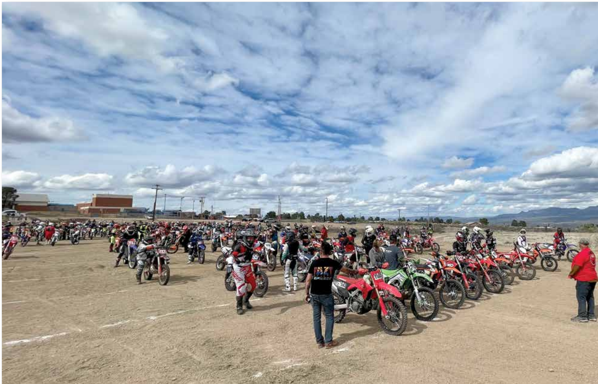
A view of racers lining up for the 2023 Copper Classic.

Preparations for the event are well underway now. On Thursday, March 7, set-up of the race campus will begin. Racing begins on Saturday, March 9, starting with Mini races at 8:30 a.m. The Big Bike racing will be starting around the noon hour. Please pay attention to and honor the road closure barriers and safety cones in and around Avenue D and Erickson Streets during these hours.