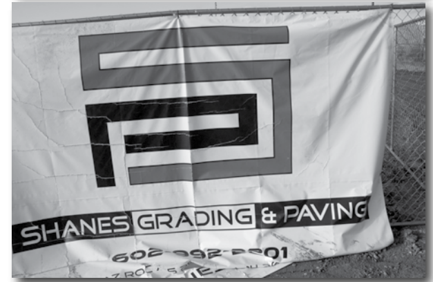
The building site for the new clinic in Kearny is being prepped for the first round of construction. The clinic is under the ownership of the Cobre Valley Regional Medical Center.