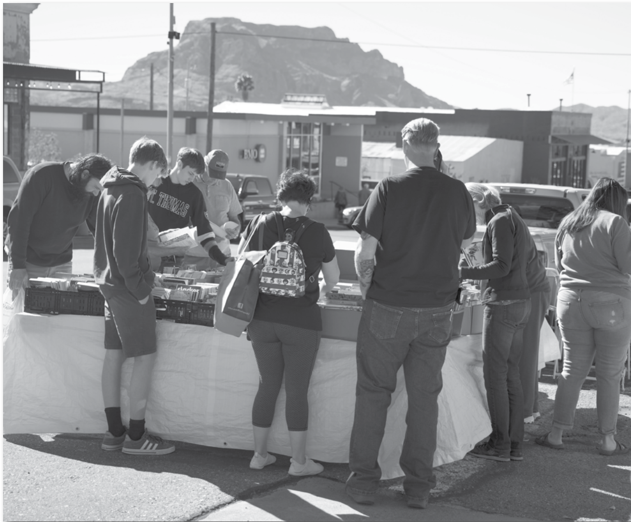
Book lovers choose new books to read at the Reading is Cool Book Fair held at the annual Home & Building Tour in Superior.