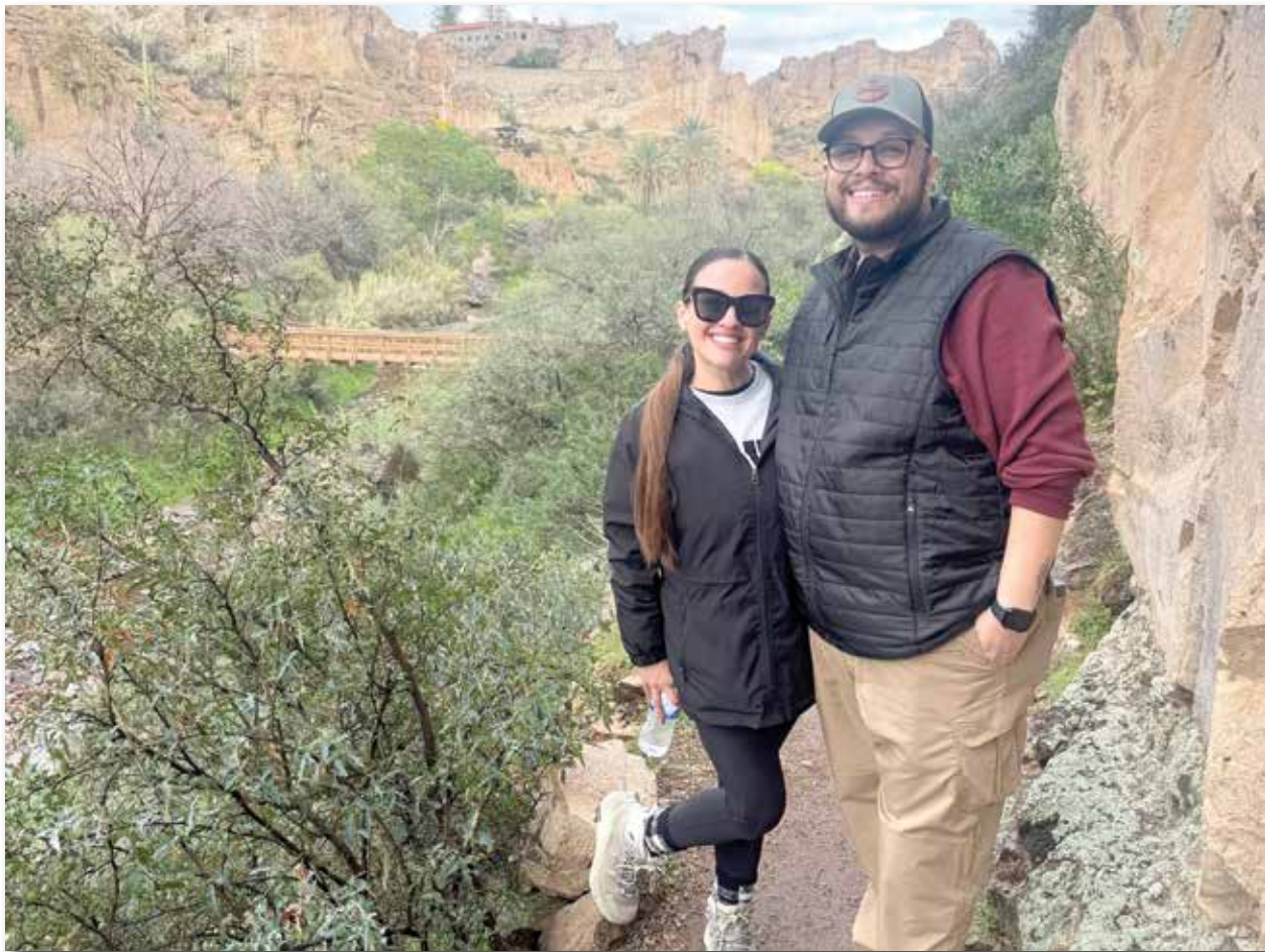
Hikers enjoy the First Day Hike at the Boyce Thompson Arboretum in Superior.