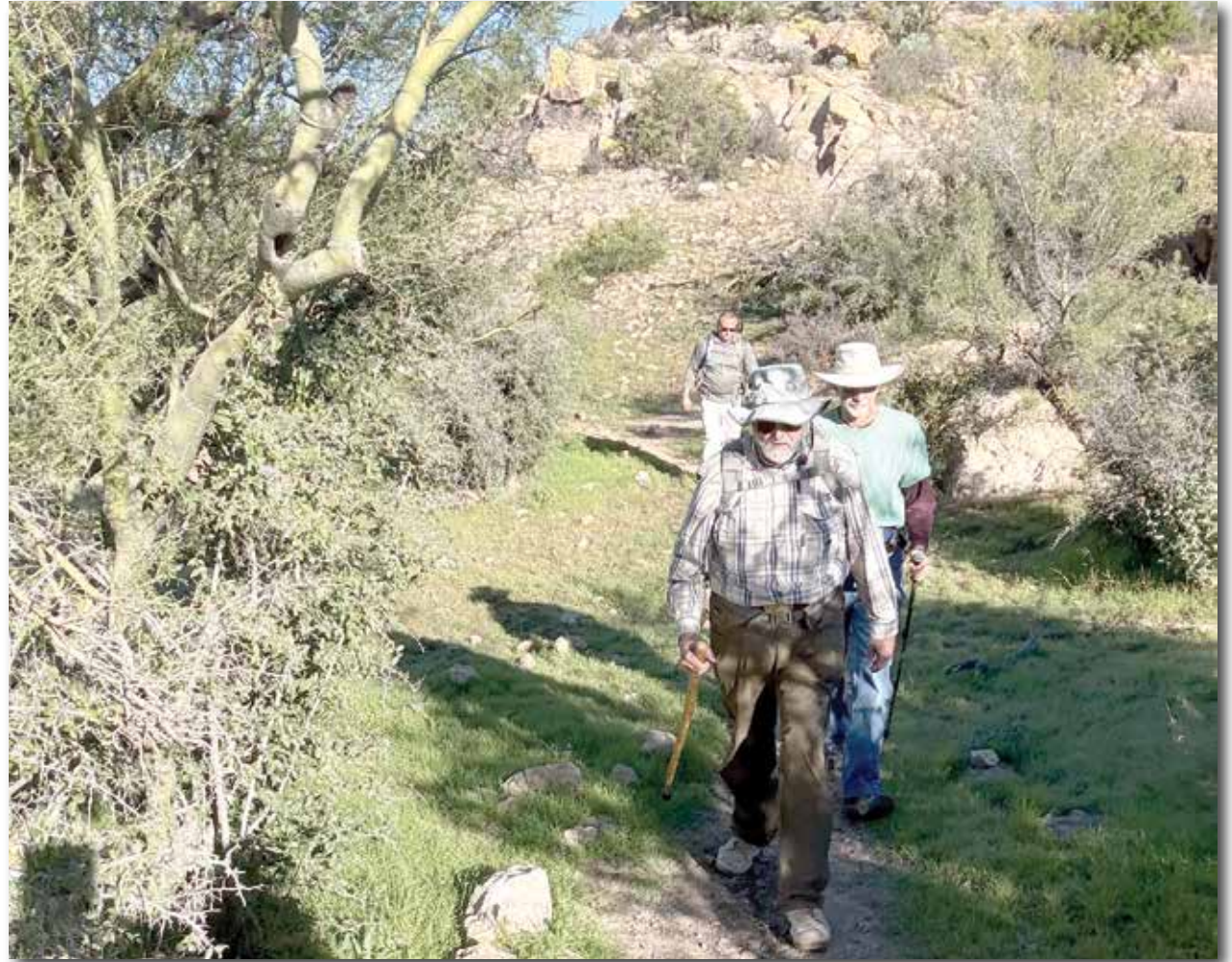
LOST volunteers, sponsors and more enjoyed a "Thank You Hike" last month.

Those recreating in the area can expect to see trail building crews and volunteers working in the area into the spring.