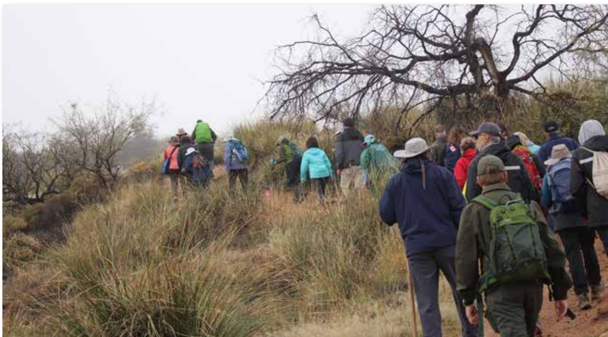
In spite of the rain and fog, 23 hikers enjoyed a First Day Hike at the Oracle State Park.

Be sure to come out and support your local state park!