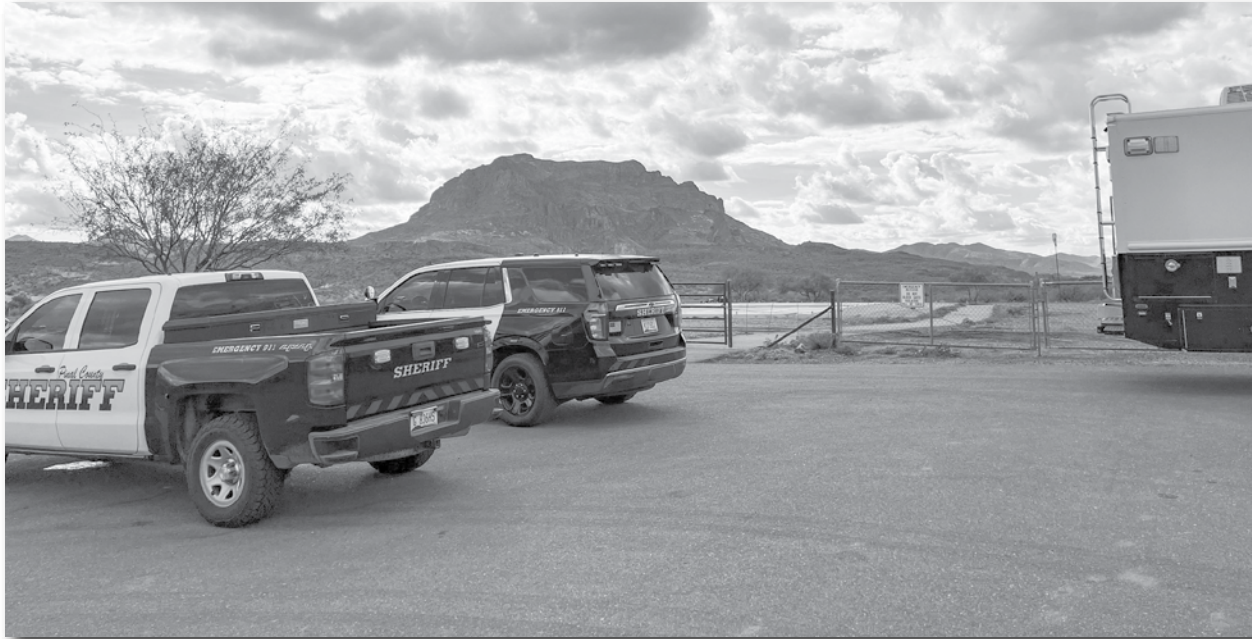
The Superior Municipal Airport (E81) was closed after a fatal helicopter accident on Friday. Pinal County Sheriff's Office used it as a staging area for rescue operations.

The investigation by the FAA and the National Transportation Safety Board is ongoing. Additional information will be released as it becomes available.