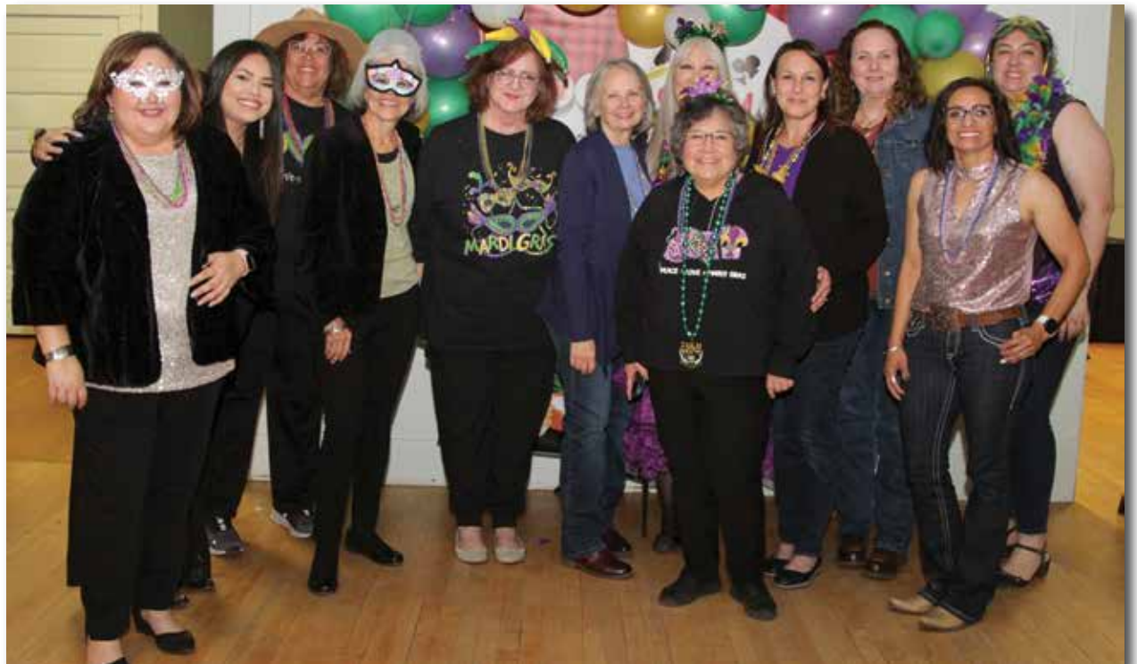
Superior Optimists at the 2023 Magma Royale.