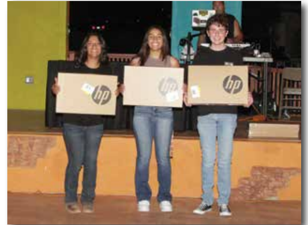
Superior Optimists celebrate their accomplishments in 2023.