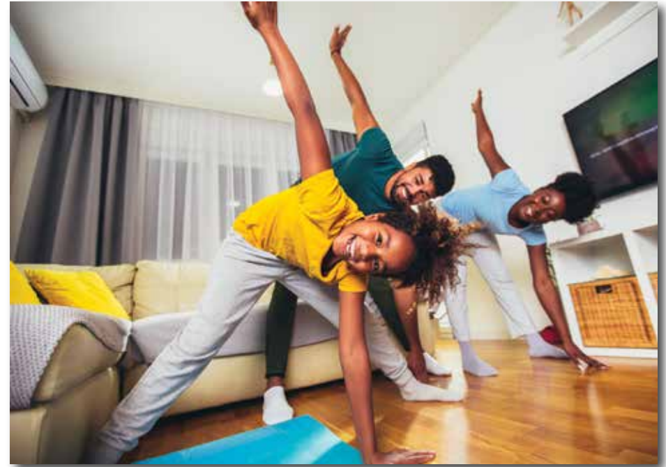
Yoga can be a good way for the whole family to get in shape.