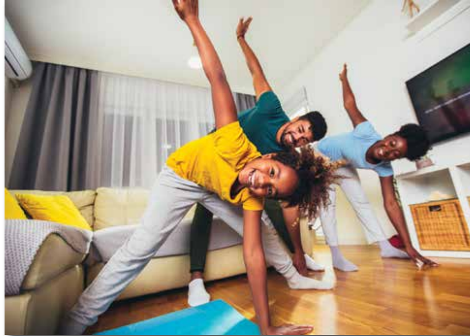
Yoga can be a good way for the whole family to get in shape.

Have a service man or woman you'd like us to recognize? We are proud to support our military and will publish the information at no charge. Email information to cbnsun@minersunbasin.com .