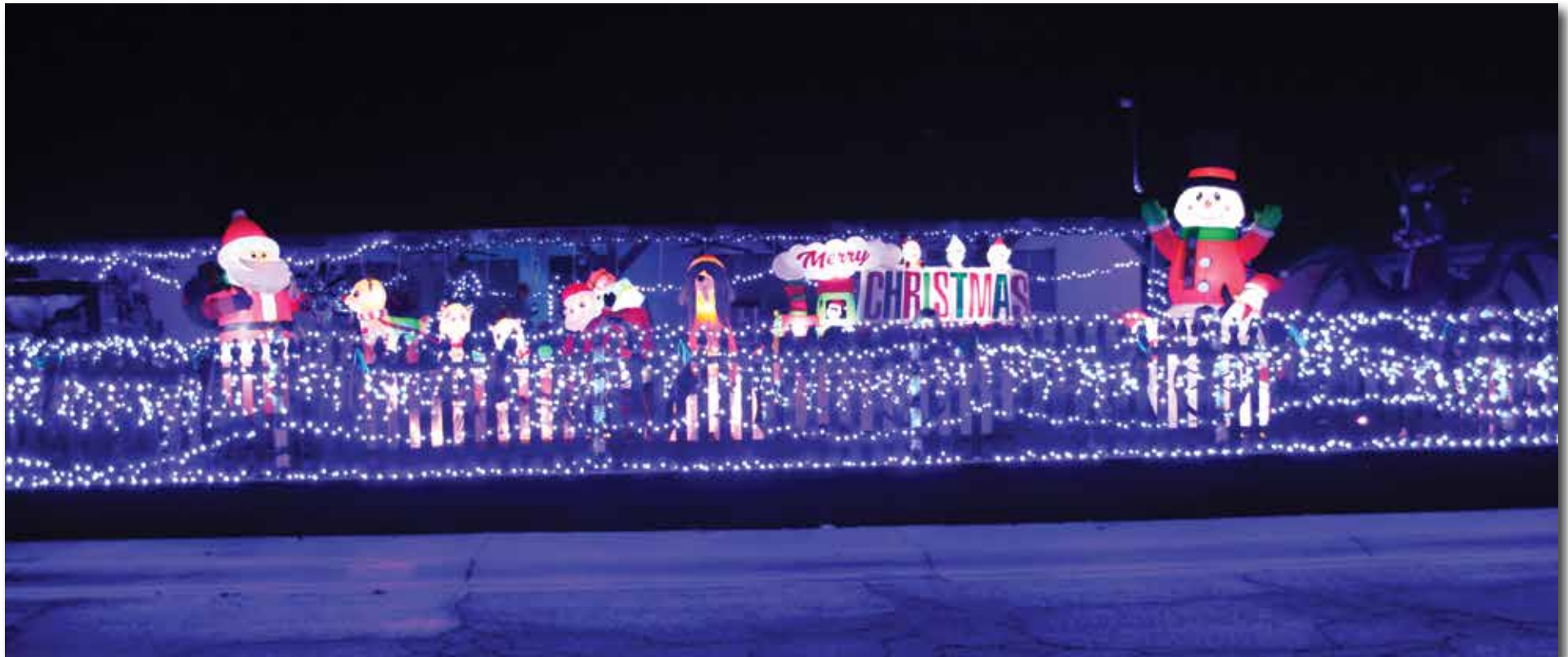
Best lawn display is Kenny and Lora Piggott at 342 Greenwich Road.