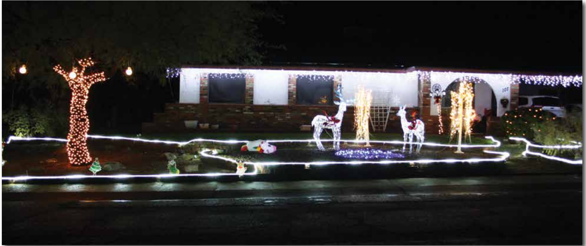
Best use of lights is Quentin and Vanessa Faucette at 107 Allen Drive.