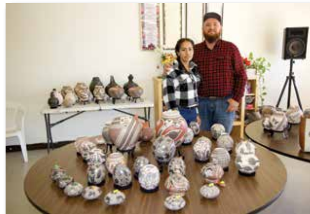
The Superior Chamber of Commerce hosted the 16th Annual Superior Home Tour & Antique Show this past weekend, Jan. 27 and 28. The event offered visitors a chance to explore several unique homes in the historic community. The event also included an antique show, pancake breakfast with the Superior Fire Department and a guided hike to the old Queen Creek Bridge.