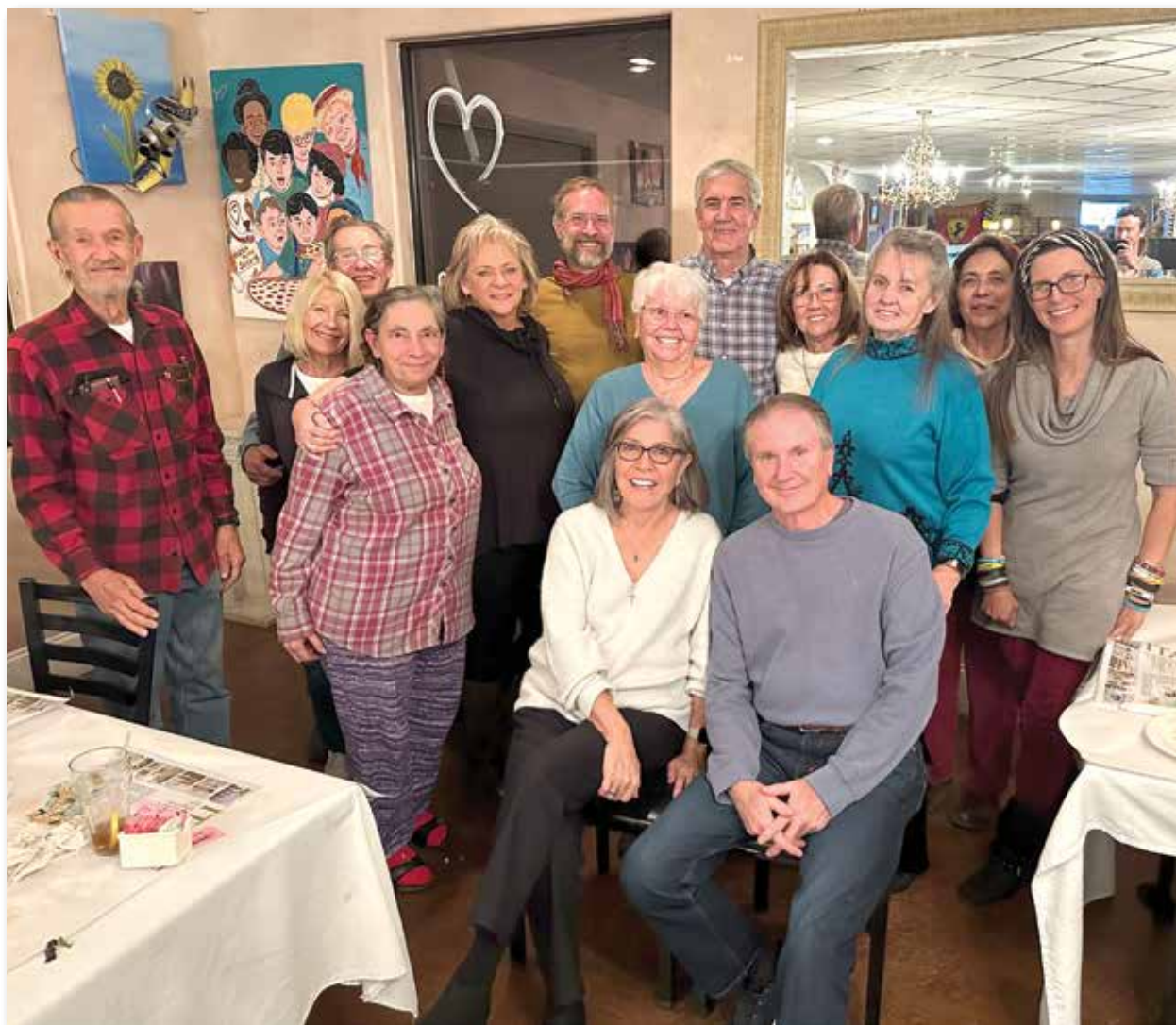
Volunteers from OWN Oracle and the Oracle Visitors Center enjoy a lovely meal and fellowship at Nonna Maria's Ristorante in Oracle. The group made the hard decision to disband.