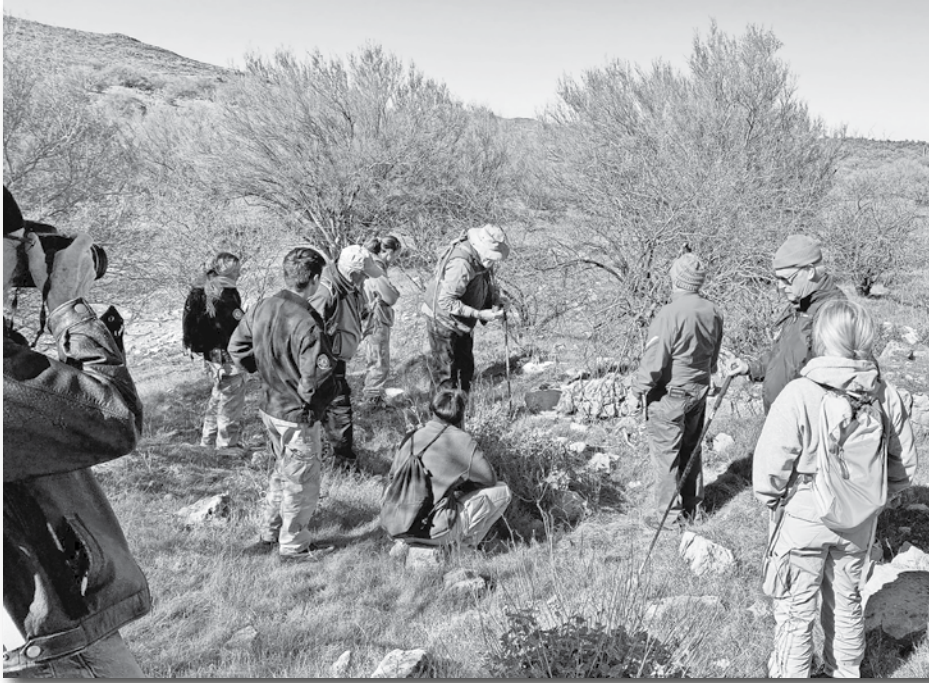
LOST's Hashbrowns, History and Hiking event in 2023. This year's first hike explores the history of U.S. 60 and the Apache Trail.

The Legends of Superior Trails Inc. is a 501c3 non-profit organization devoted to building, maintaining and promoting trails in Superior and the surrounding Tonto National Forest. You can learn more about the LOST on their website: superioraztrails.com or their Facebook page @LOSTInSuperiorAZ