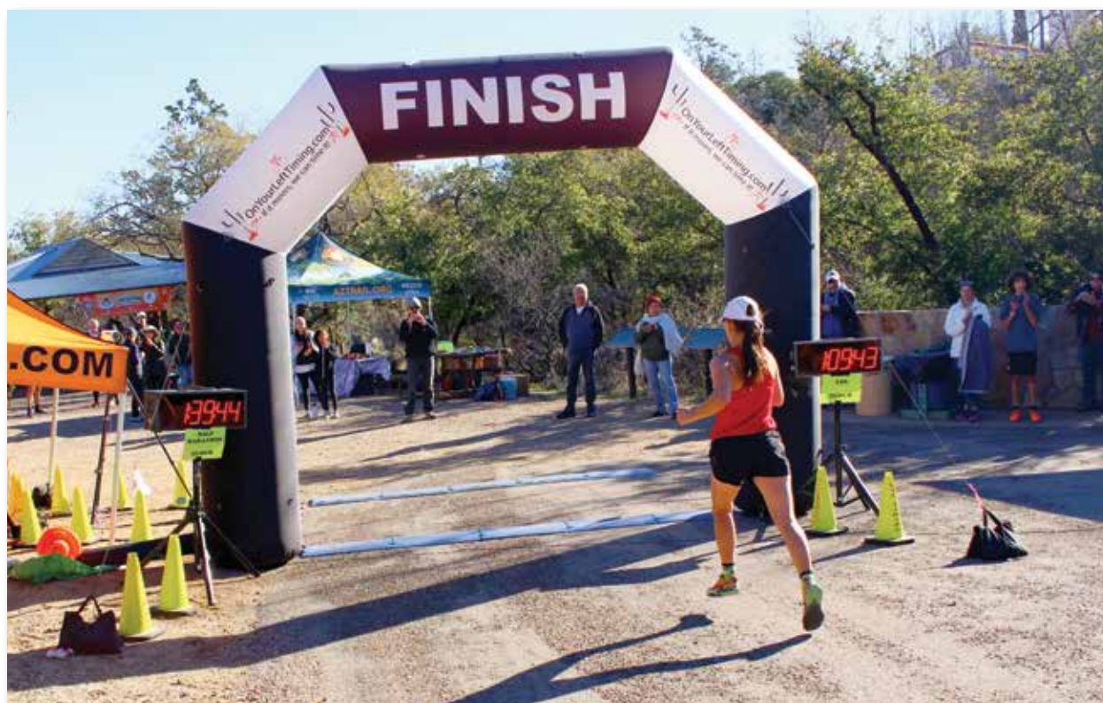
Crossing the finish line.