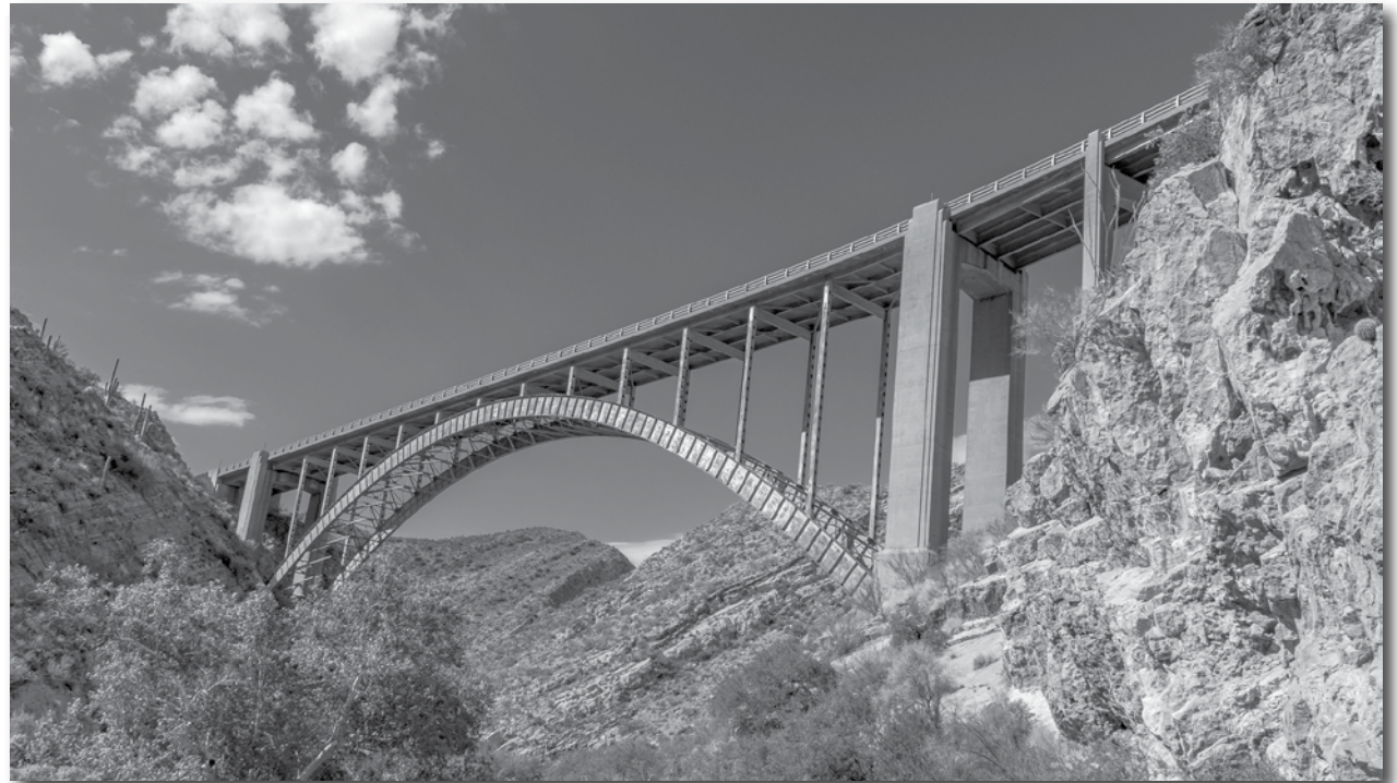
This aging bridge east of Superior will be replaced. Construction begins soon.