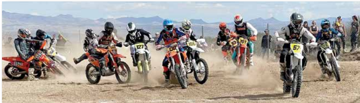
Racers and spectators enjoy the action at a past San Manuel Copper Classic. This popular event returns to San Manuel on March 8, 2025.