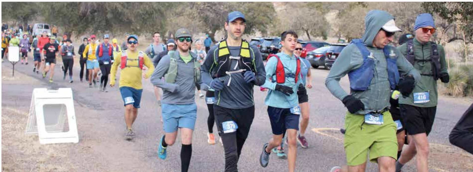
Half marathon runners make their way through the Oracle State Park Saturday during the Arizona Trail Oracle Rumble.

Runners praised the well marked and clear trail, and the friendliness of all staff working the event. Official results for the race are not available at press time.