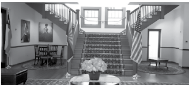
Historic Hotel Magma

Welcome to the 16th Annual Superior Home Tour