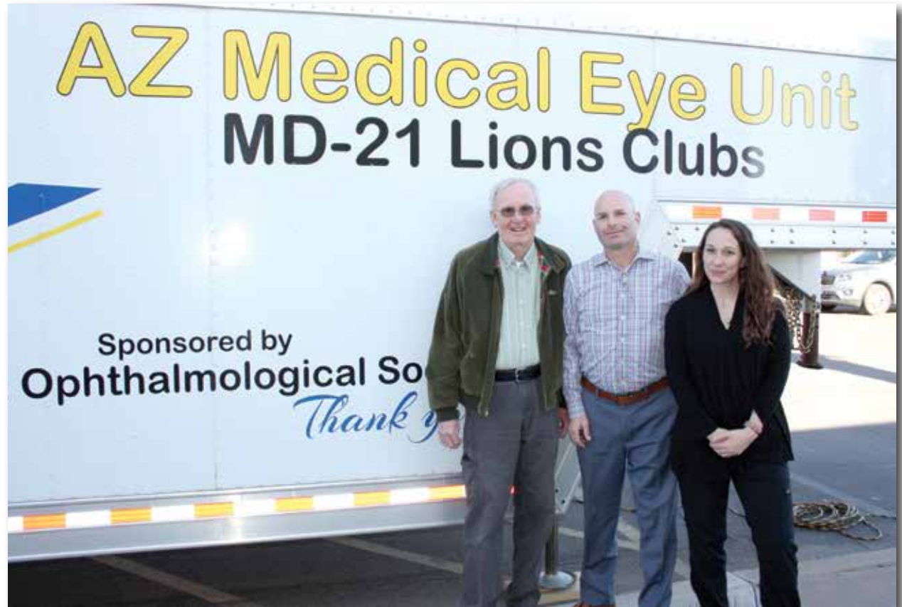
The Lions Club Arizona Medical Eye Unit will be in Kearny on Jan. 29.

Sponsors of the Arizona Medical Eye Unit in Kearny are the Kearny Women's Club. This organization is in charge of all arrangements and appointments. The fee per patient is $40 cash.