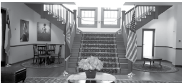
Historic Hotel Magma

Welcome to the 16th Annual Superior Home Tour