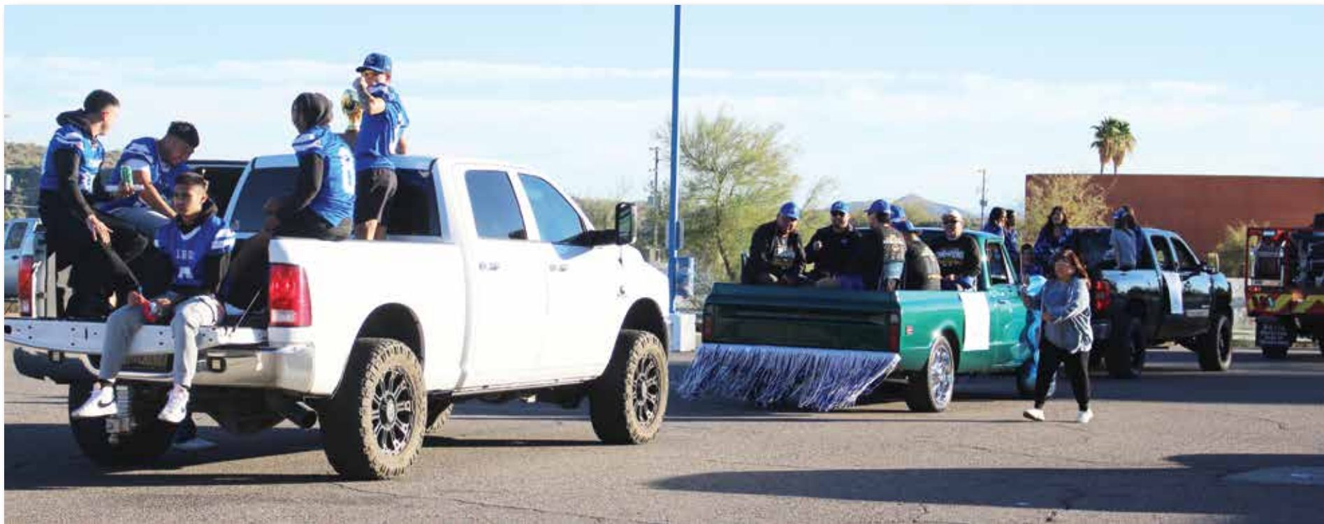
Hayden football team, coaches and cheerleaders parade through Hayden and Winkelman celebrating the team's back-to-back championships.