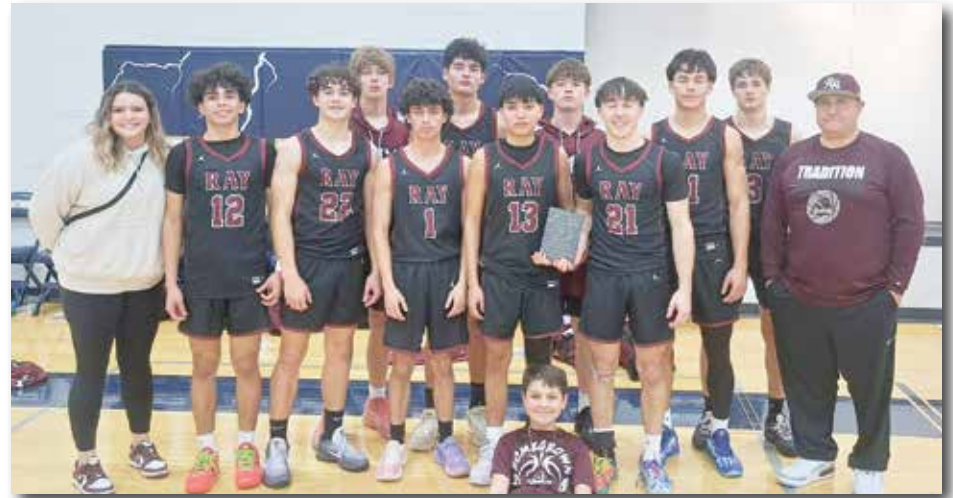
Ray Bearcats 2024-25 Varsity Basketball Team, runners up in the Epic Tourneys New Years Classic.

Both teams will host Ray on Wednesday, Jan. 15, with the girls game starting at 5:30 p.m. and the boys game at 7 p.m. They will both host Superior the following day, with the same start times. On Friday, they will travel to take on Valley Lutheran.